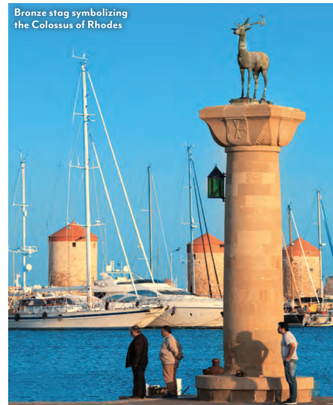
Bronze stag symbolizing the Colossus of Rhodes