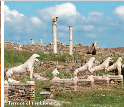
Terrace of the Lions