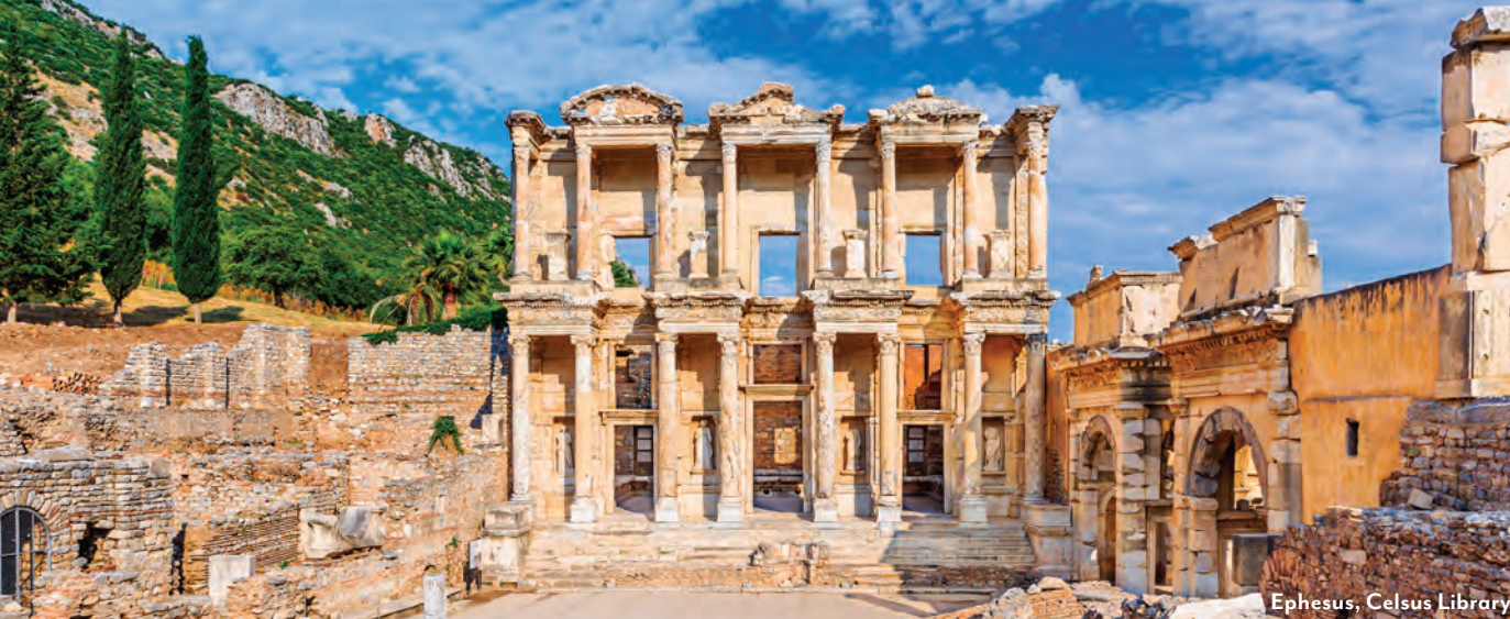
Ephesus, Celsus Library