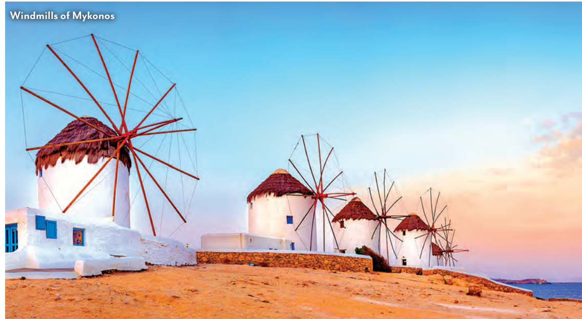
Windmills of Mykonos

Departures: October 3 to 11 | October 10 to 18 | October 17 to 25, 2023