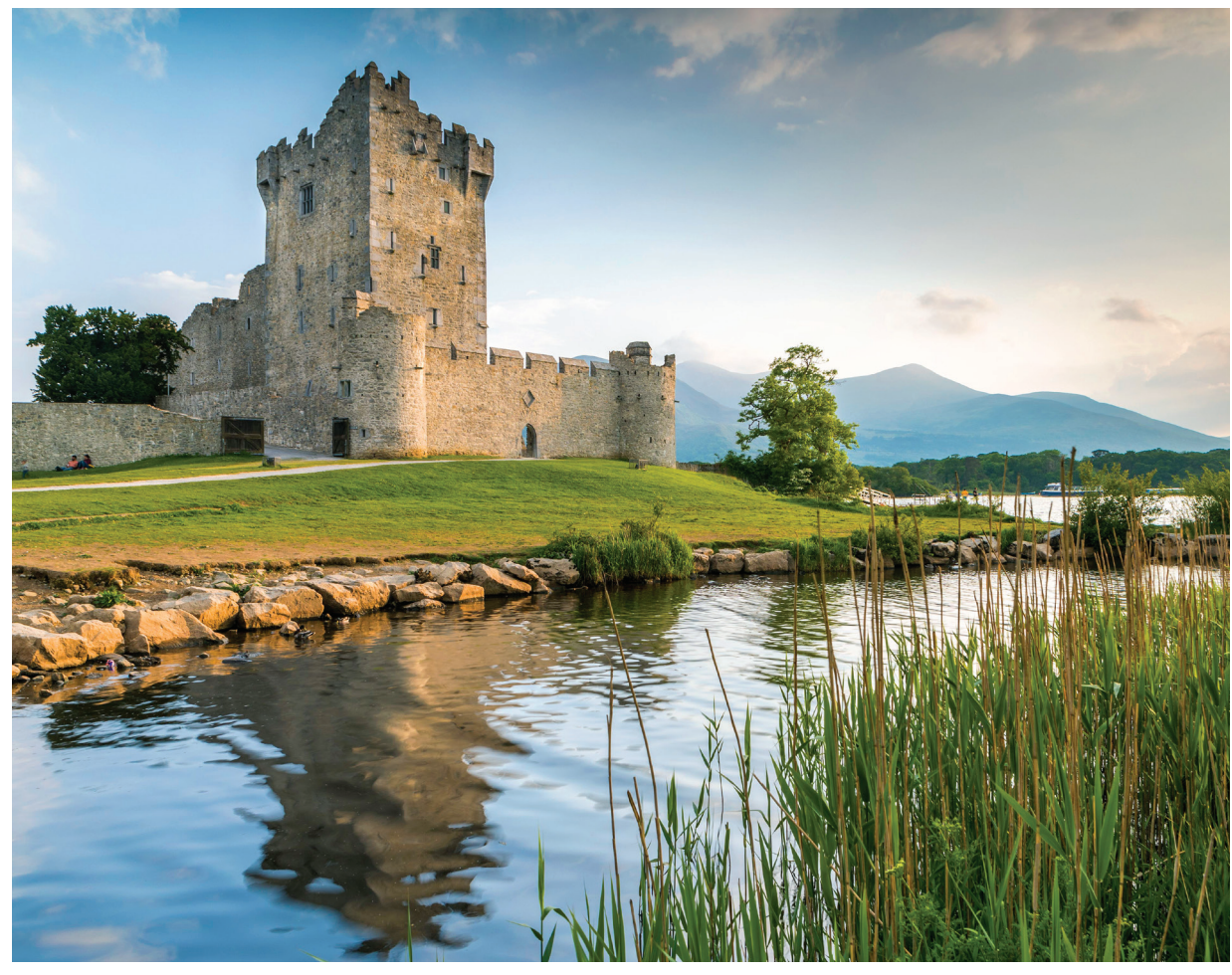
On Day 8, we visit lakeside Ross Castle in Killarney National Park.

Ratings are based on the Hotel & Travel Index, the travel industry standard reference.