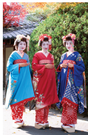
Geishas in traditional dress

Day 8: Takayama/Shirakawago/Kanazawa We leave Takayama this morning for the UNESCO World Heritage site of Shirakawago Gassho-zukuri Village. Comprising buildings relocated from authentic villages nearby that were razed for a dam, the village is also a vibrant community whose residents work together to preserve the unique traditional architecture here known as Gassho style. Then we visit Gokayama Village to see how traditional Japanese washi paper is made. Late this afternoon we reach the castle town of Kanazawa, an alluring coastal city that survived the ravages of World War II. B,L