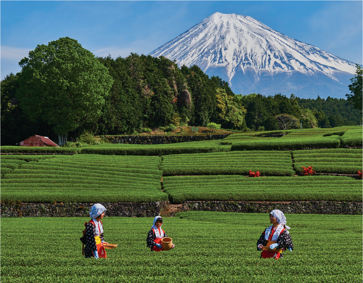
A UNESCO site and “Special Place of Scenic Beauty,” beloved Mount Fuji has drawn visitors for centuries.