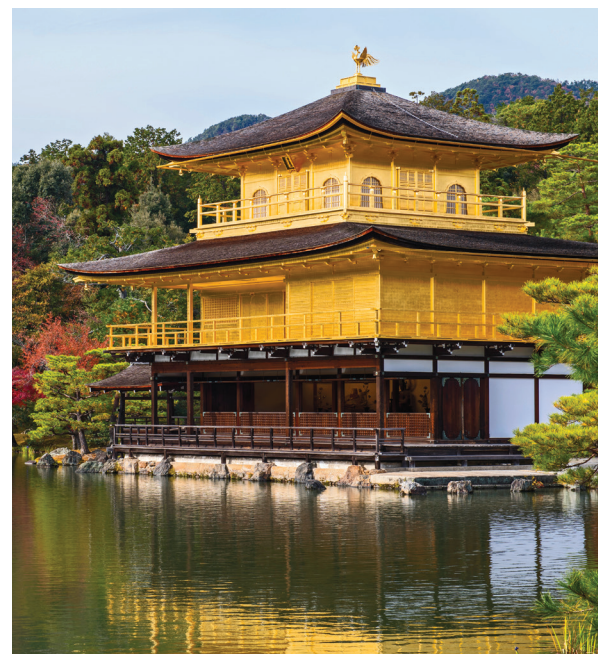
We visit Kyoto's Temple of the Golden Pavilion on Day 10.

Day 12: Kyoto We continue our encounter with Kyoto today, first at the important Fushimi Inari shrine, with its trails straddled by red torii gates; Sanjyusangendo Hall (ca. 1266), an important Buddhist temple housing 1,000 statues of the Thousand-Armed Kannon deity; and Nishiki Market, “Kyoto's Kitchen” of restaurants, stores, and stalls selling everything food-related. Then this afternoon is at leisure; tonight we toast our Japan adventure at a farewell dinner at a local restaurant. B,D