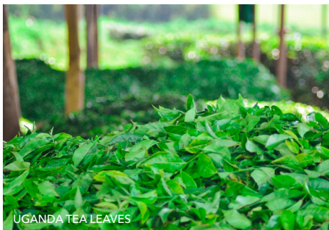
UGANDA TEA LEAVES

Spend the day enjoying game drives in the Mweya area of QENP against the beautiful backdrop of crater lakes and mountain ranges. Embark on another boat cruise along the Kazinga Channel and look for elephants, buffalos, antelopes, warthogs, hippos, and crocodiles basking on the shore. Kazinga’s shores are a haven for numerous birds, including many migratory species as they make their way south to warmer climates. The cruise also provides a spectacular view of the beautiful Mweya Peninsula and life in local fishing villages set along the banks. Overnight at Mweya Safari Lodge. (BLD)