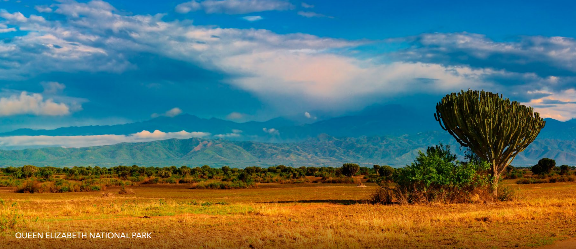
QUEEN ELIZABETH NATIONAL PARK

WHY UGANDA? Nestled in the heart of east Africa, Uganda is home to a remarkable 13 primate species, and offers the opportunity to observe gorilla and chimpanzee populations up close in their native habitats. Mountain gorillas in particular are extremely rare, with only an estimated 850 remaining in the wild.