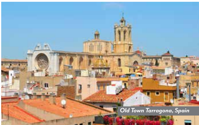
Old Town Tarragona, Spain

In Granada explore the Alhambra Palace and brilliant gardens of the Palace of Generalife, collectively a UNESCO World Heritage Site. Originally designed as a military area, the Alhambra became the residence of royalty and of the court of Granada in the middle of the 13 th century, and later