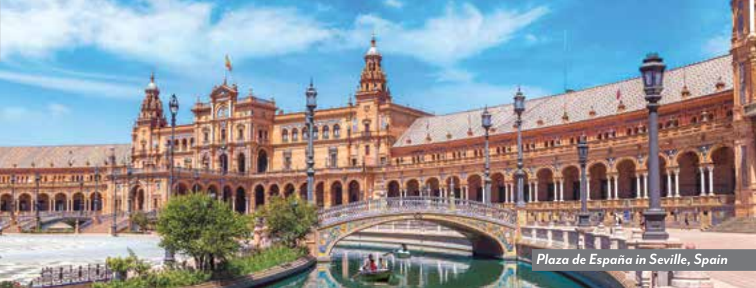
Plaza de España in Seville, Spain