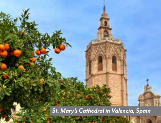
St. Mary's Cathedral in Valencia, Spain