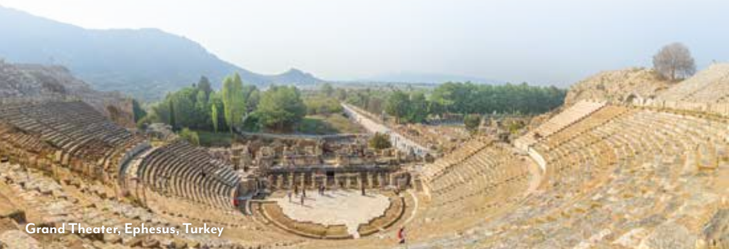
Grand Theater, Ephesus, Turkey

The Roman writer Cicero observed of Athens that “wherever you set your foot, you encounter some memory of the past.” In Greece and Turkey, the stories of antiquity come to life. St. John the Apostle is believed to have penned the Book of Revelation on Patmos; the legend of the lost utopian city of Atlantis lives on in Santorini; and it is on these mythological islands that Odysseus sought redemption in the Underworld and where Orpheus retrieved his first love. Walk the Sacred Way of Delos and discover ancient Akrotiri — the “Minoan Pompeii.” Enjoy exclusive cultural enrichments, including a classical concert at the historical Caravanserai building in Kusadasi and a traditional Greek folklore performance on this immersive itinerary.