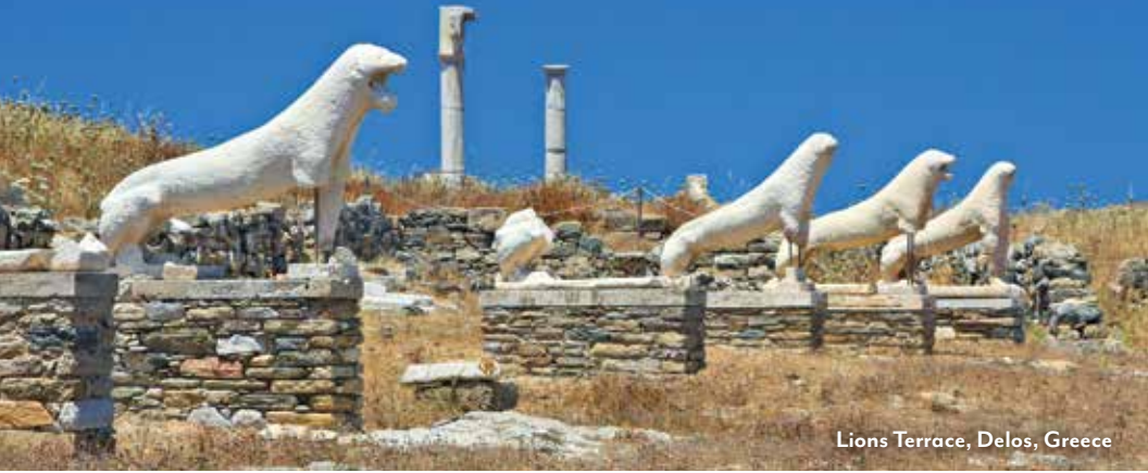
Lions Terrace, Delos, Greece

The Roman writer Cicero observed of Athens that “wherever you set your foot, you encounter some memory of the past.” In Greece and Turkey, the stories of antiquity come to life. St. John the Apostle is believed to have penned the Book of Revelation on Patmos; the legend of the lost utopian city of Atlantis lives on in Santorini; and it is on these mythological islands that Odysseus sought redemption in the Underworld and where Orpheus retrieved his first love. Walk the Sacred Way of Delos and discover ancient Akrotiri — the “Minoan Pompeii.” Enjoy exclusive cultural enrichments, including a classical concert at the historical Caravanserai building in Kusadasi and a traditional Greek folklore performance on this immersive itinerary.