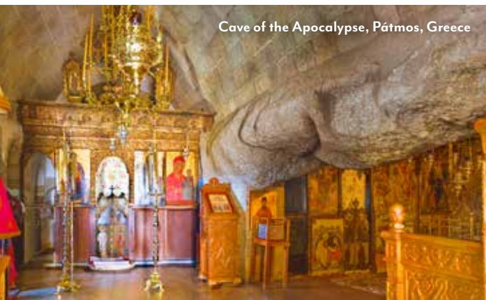
Cave of the Apocalypse, Pátmos, Greece

Explore the medieval old town as it was built by the Order of St. John, which occupied Rhodes from the early 14th century through the 16th century.