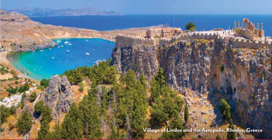
Village of Lindos and the Acropolis, Rhodes, Greece

Visit the Palace of the Grand Masters, a formidable Gothic castle that houses a treasure trove of art, furniture and icons from that era.