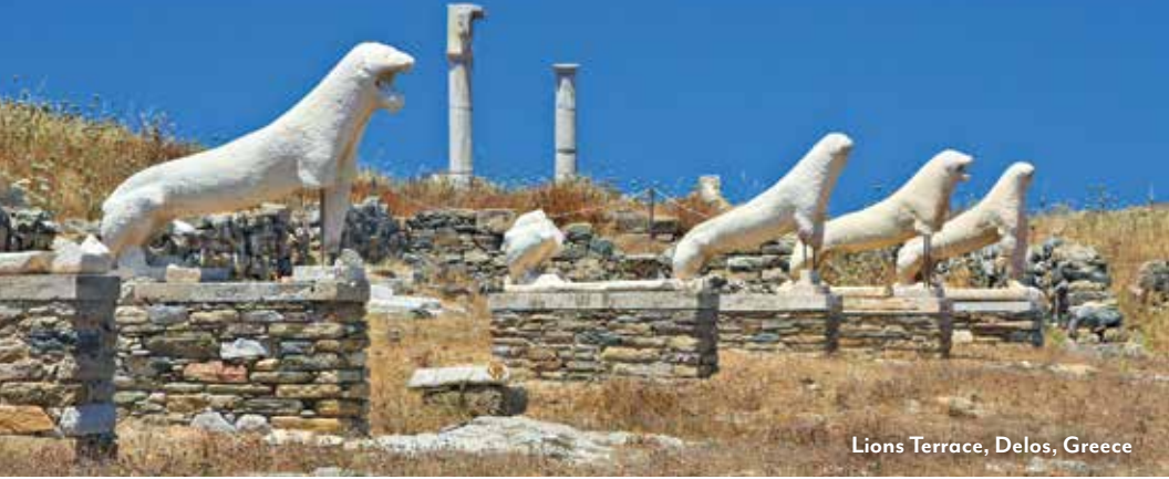
Lions Terrace, Delos, Greece

The Roman writer Cicero observed of Athens that “wherever you set your foot, you encounter some memory of the past.” In Greece and Turkey, the stories of antiquity come to life. St. John the Apostle is believed to have penned the Book of Revelation on Patmos; the legend of the lost utopian city of Atlantis lives on in Santorini; and it is on these mythological islands that Odysseus sought redemption in the Underworld and where Orpheus retrieved his first love. Walk the Sacred Way of Delos and discover ancient Akrotiri — the “Minoan Pompeii.” Enjoy exclusive cultural enrichments, including a classical concert at the historical Caravanserai building in Kusadasi and a traditional Greek folklore performance on this immersive itinerary.