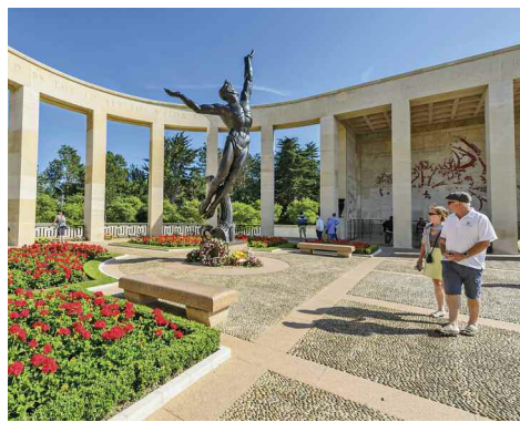
Normandy American Cemetery