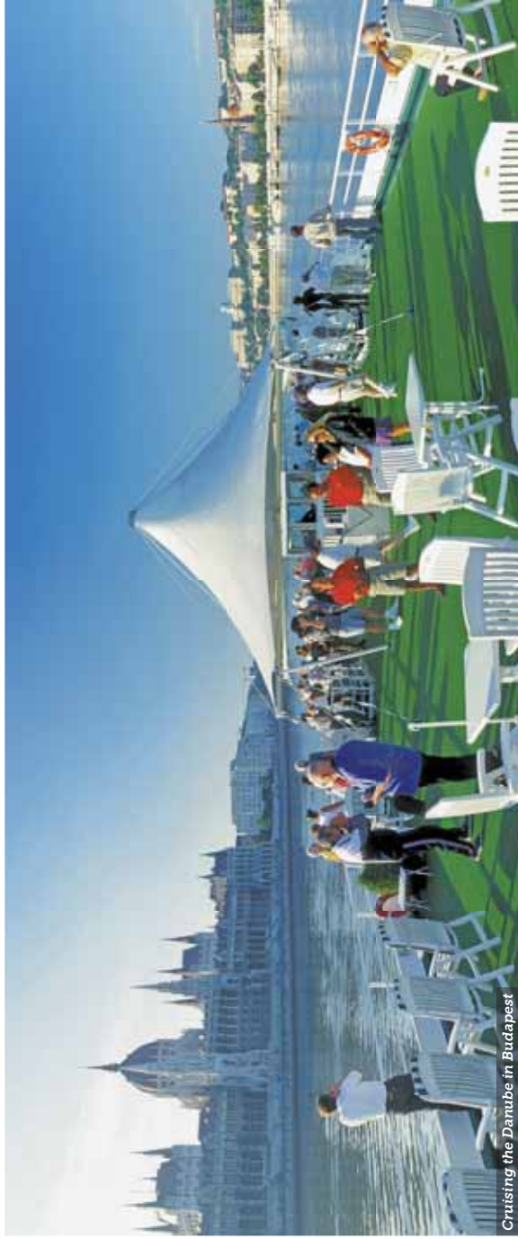
Cruising the Danube in Budapest