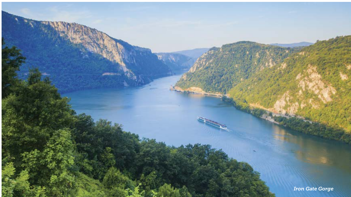
Iron Gate Gorge