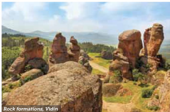
Rock formations, Vidin