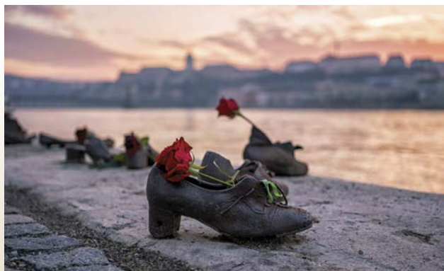
Left: Serbian folk dancers | Above: Shoes on the Danube Bank Memorial