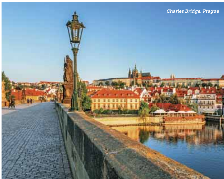
Charles Bridge, Prague