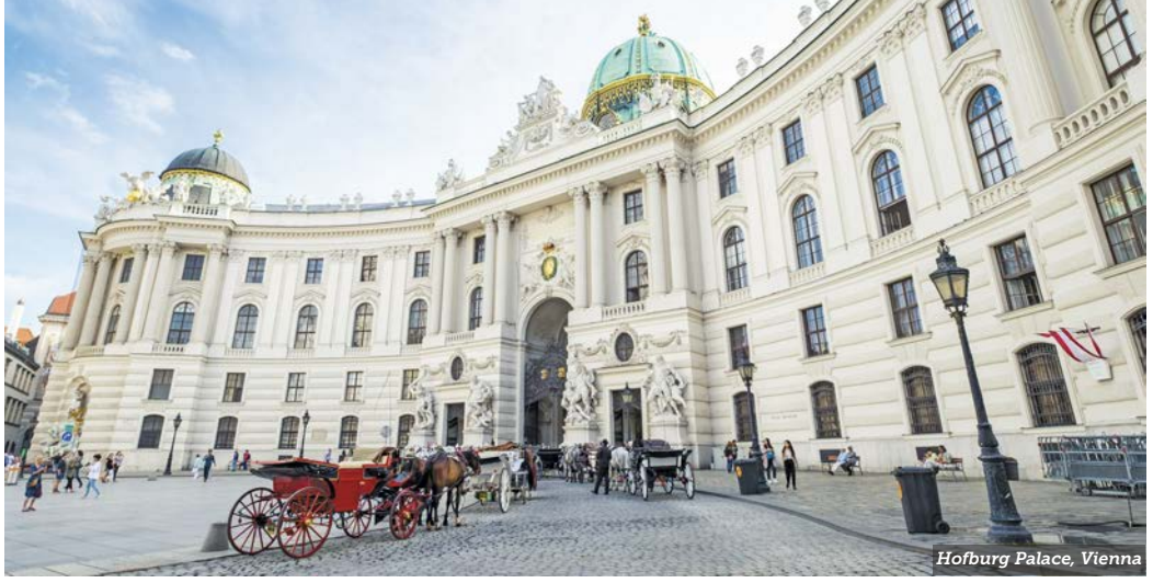
Hofburg Palace, Vienna

rich past. See St. Martin's Cathedral, the Slovak National Theatre, St. Michael's Gate and Primate's Palace, where Hungarian archbishops spend their winters, and sample pastry at a café.