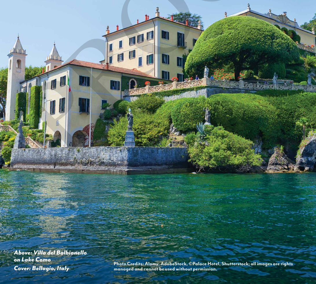
Above: Villa del Balbianello on Lake Como