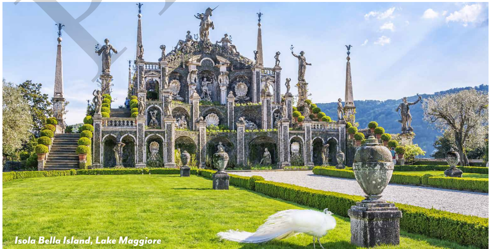
Isola Bella Island, Lake Maggiore

For reservations, call Gohagan & Company at 800-922-3088 or visit gohagantravel.com/reserve