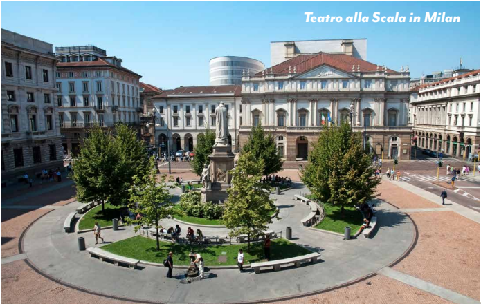
Teatro alla Scala in Milan

Como | Stresa for Borromean Islands Enjoy a private boat transfer on Lake Maggiore , sailing past islands with beautiful villas, graced with natural beauty. Visit the crown jewel of the Borromean archipelago , Isola Bella , boasting the 17th-century Palazzo Borromeo . Explore the