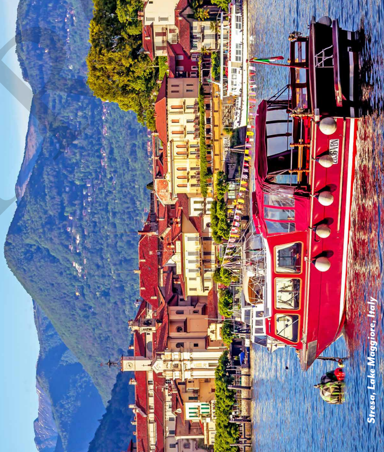
Siresa, Lake Maggiore, Italy