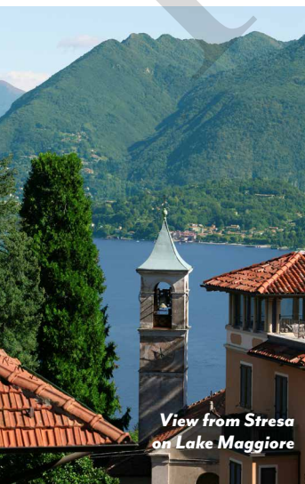
View from Stresa on Lake Maggiore

baroque palace with its astounding collection of art and antiques, and the summerhouse, which is home to a mosaic marine-themed grotto. Stroll the lush gardens, filled with rare flowers and plants, statuary, architectural details and strutting white peacocks. Reboard the boat for the return to Stresa, the setting for Hemingway's iconic novel "A Farewell to Arms." Enjoy spectacular mountain views as you explore the town and have lunch on your own. This afternoon at the hotel, hear a lecture by a local expert on the silk industry, then enjoy dinner on your own.