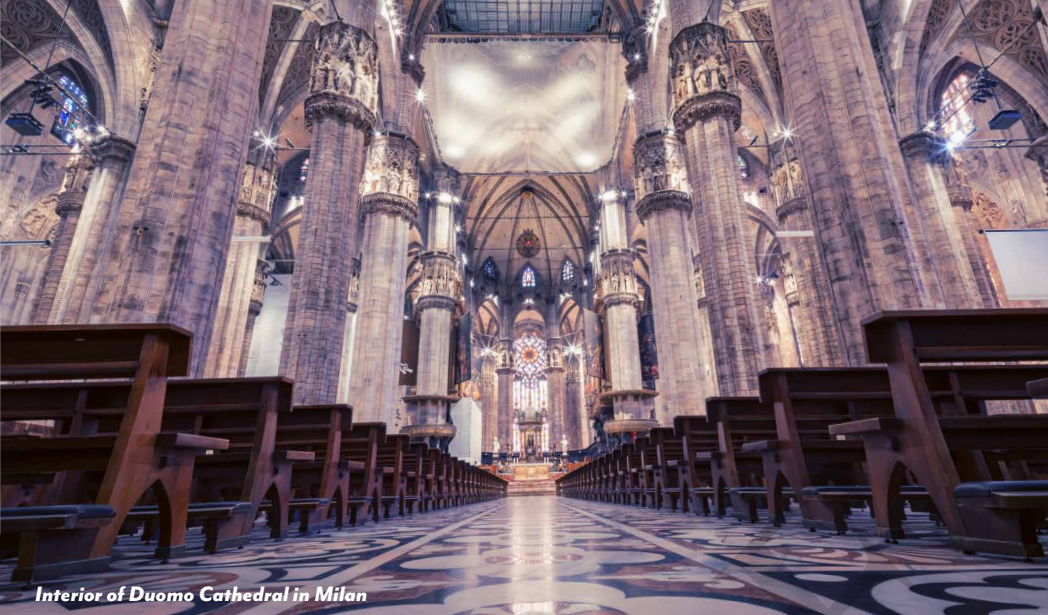
Interior of Duomo Cathedral in Milan