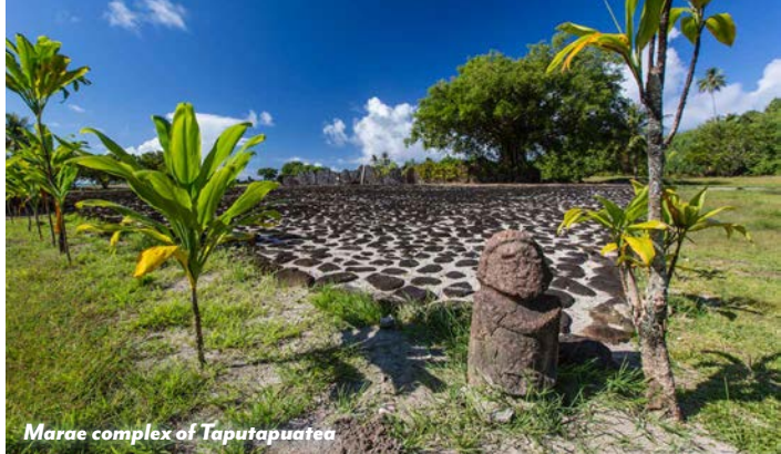
Marae complex of Taputapuātea