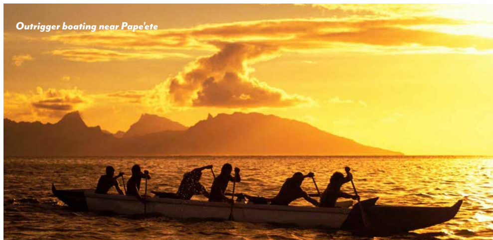
Outrigger boating near Pape'ete

For reservations, call Gohagan & Company at 800-922-3088 or visit gohagantravel.com/reserve