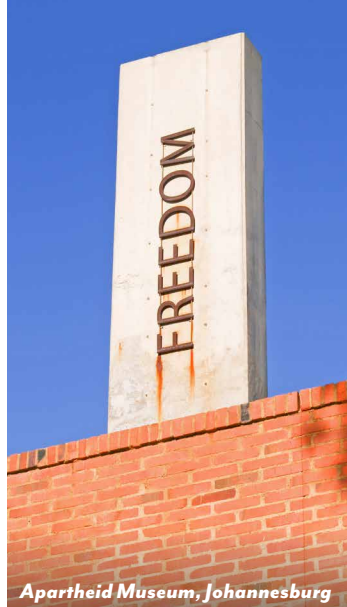
Apartheid Museum, Johannesburg

a different perspective as the animals venture to the Chobe River, to cool off during the afternoon heat. Expert local guides will lead game-viewing river safaris aboard small excursion boats through this unspoiled ecosystem.