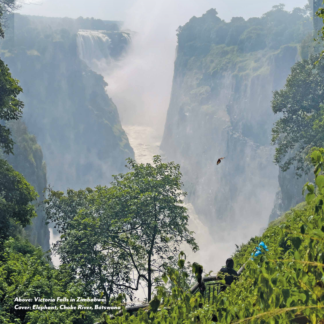
Above: Victoria Falls in Zimbabwe Cover: Elephant, Chobe River, Botswana