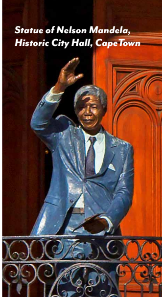
Statue of Nelson Mandela, Historic City Hall, Cape Town