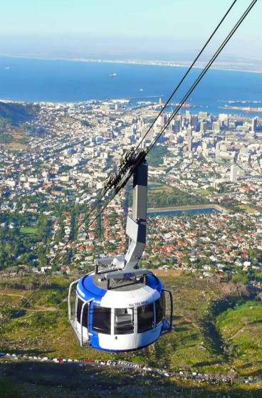
Table Mountain cable car