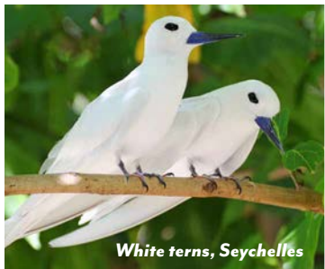
White terns, Seychelles

of coral fish and corals, five species of sea turtles, 31 species of birds and 18 species of reptiles. Look for diverse wildlife, including Brookesia Micra, the smallest chameleon in the world. Afterward, relax on the beach, taking in the incredible vistas.