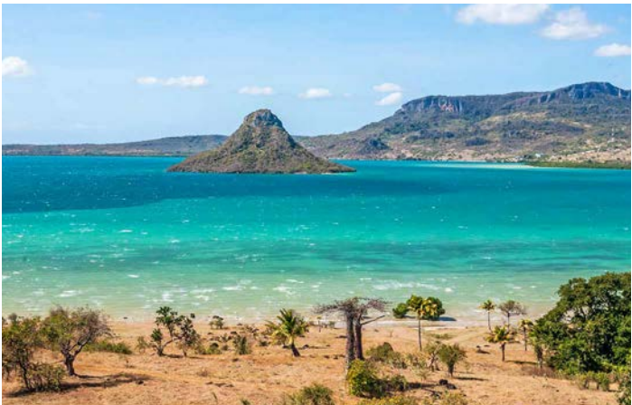
Sugar Loaf Island in Diego Suarez Bay, Madagascar

The unspoiled beauty of this Marine National Park is breathtaking. This veritable open-air aquarium is inhabited by: whales and dolphins, hundreds of species