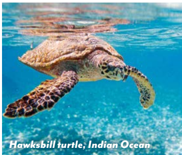
Hawksbill turtle, Indian Ocean