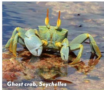
Ghost crab, Seychelles