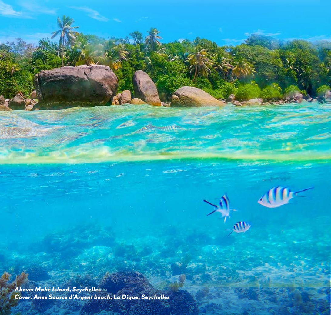
Above: Mahé Island, Seychelles