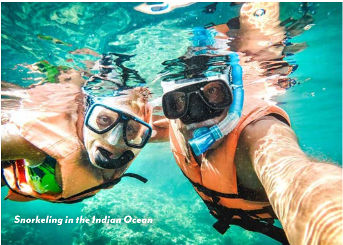
Snorkeling in the Indian Ocean

Remire Island Remire Island boasts unique biodiversity. On a guided walk through the island's lush vegetation, observe diverse wildlife, including endemic birds and reptiles.