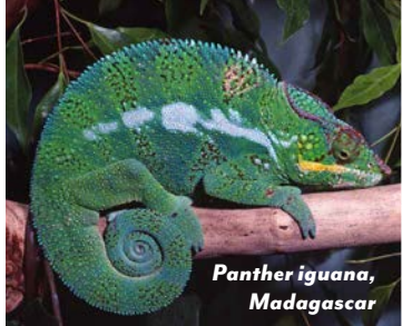
Panther iguana, Madagascar