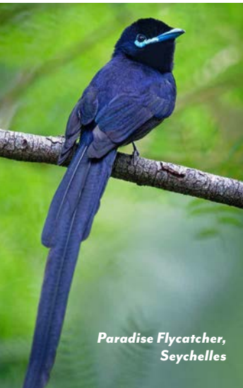
Paradise Flycatcher, Seychelles

The extensive salt flats and shallow waters around Farquhar make it a haven for many exotic species, including the bumphead parrotfish, which thrive here. Explore the pristine beaches, mangrove forests and coastal dunes.