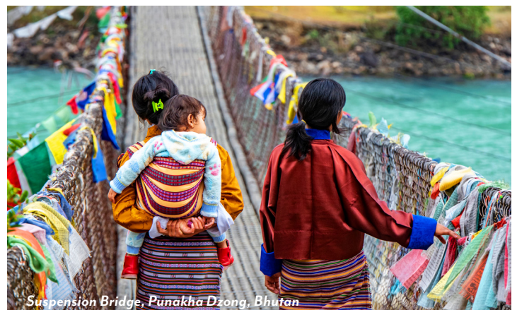
Suspension Bridge, Punakha Dzong, Bhutan