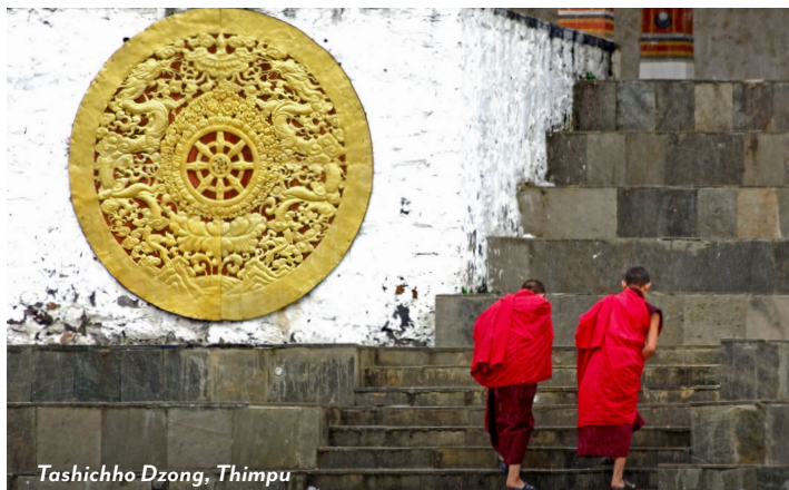
Tashichho Dzong, Thimpu

September 23 to 27, 2026 | Program Begins: September 25