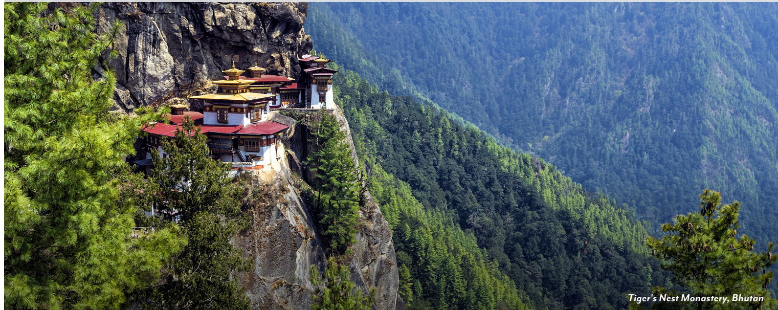
Tiger's Nest Monastery, Bhutan