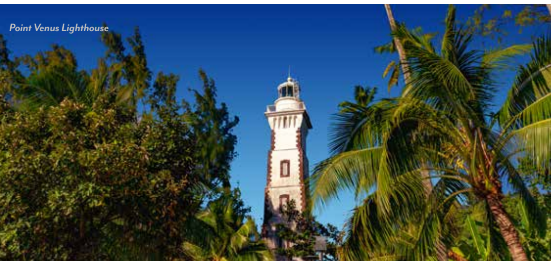
Point Venus Lighthouse

Today the ship arrives in Bora Bora, where you