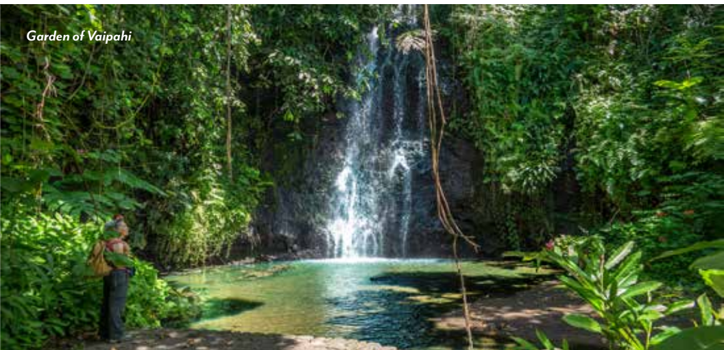
Garden of Vaipahi