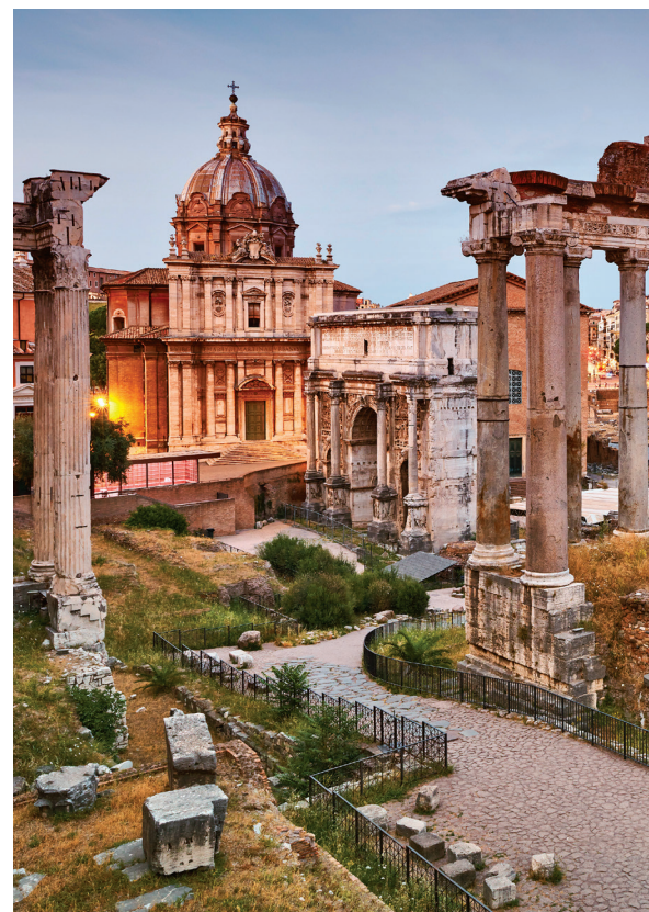
The Roman Forum dates to the 7 th century BCE.

Day 16: Depart for U.S. We depart early this morning for our connecting flights to the U.S. B