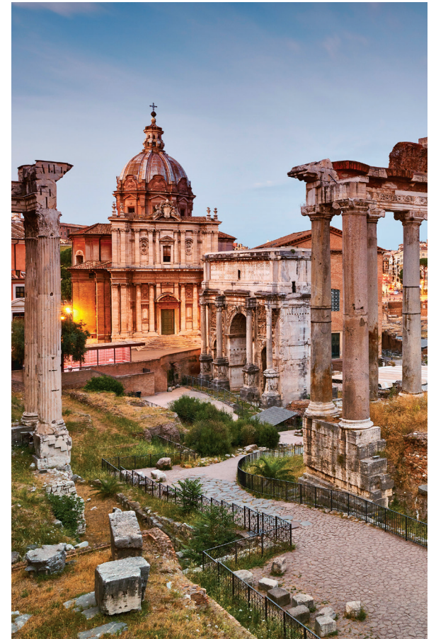
The Roman Forum dates to the 7 th century BCE.

Day 16: Depart for U.S. We depart early this morning for our connecting flights to the U.S. B