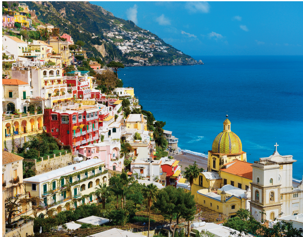
We spend three nights on the stunning Amalfi Coast, with its sheer cliffs, turquoise seas, and classic Mediterranean landscape.

From the breathtaking Amalfi Coast to eternal Rome, through the gentle Umbrian and Tuscan countryside to timeless Venice, this wide-ranging tour showcases ancient sites, contemporary life, priceless art, and beautiful natural scenery. You'll especially appreciate the small size of your group as you stay in unique accommodations in the Tuscan countryside and in a medieval village.