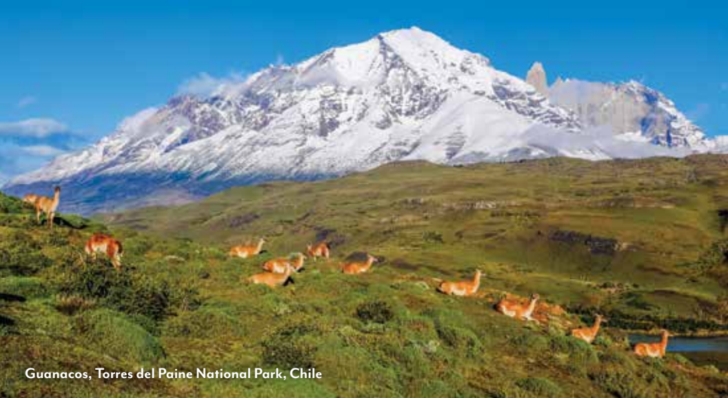
Guanacos, Torres del Paine National Park, Chile