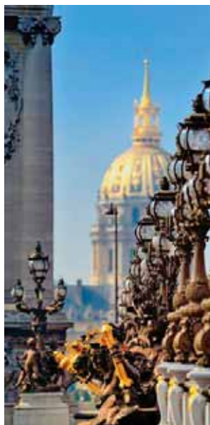
Pont Alexandre III

Knowledgeable Lecturers deepen your appreciation for the region and its history, culture and current events.