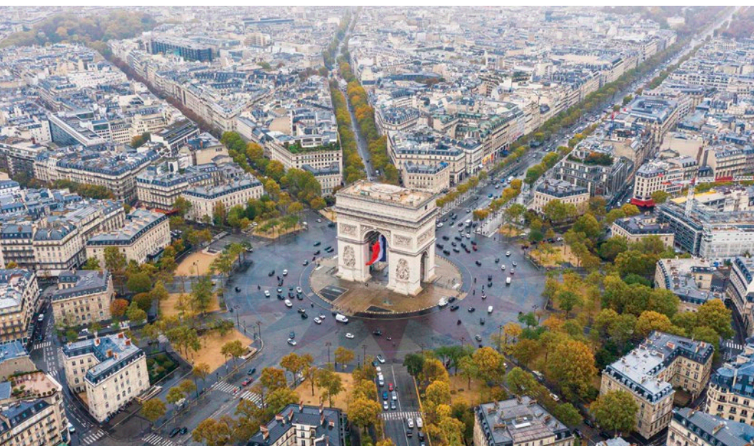
Champs-Élysées leading to the Arc de Triomphe

🕒 Elective | Versailles. Travel to France's grandest palace, a baroque chateau that was once the kingdom's political capital and the seat of the royal court. Walk in the footsteps of kings, queens and courtiers while visiting the palace and its gardens. Delight in ornate ceilings, rich tapestries and lavish galleries, and see the Hall of Mirrors, the room where the Treaty of Versailles was signed.