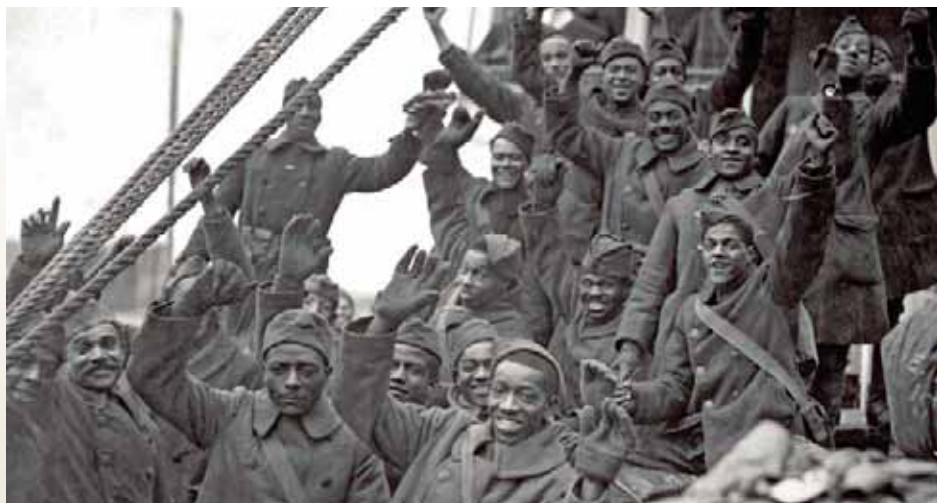
369th Infantry Regiment