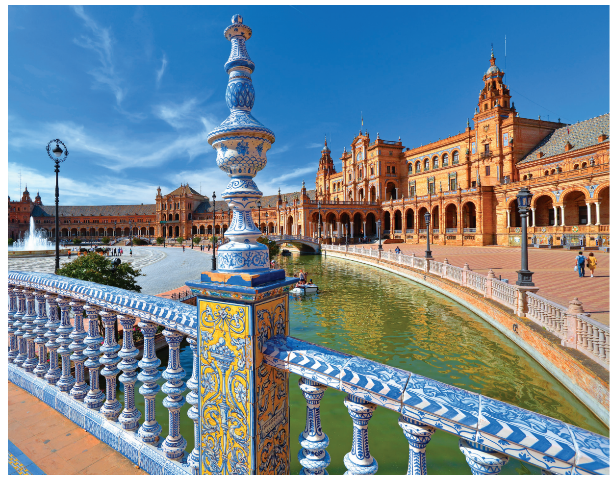
Seville's Plaza de España, the most striking public square in Spain

Ratings are based on the Hotel & Travel Index, the travel industry standard reference.