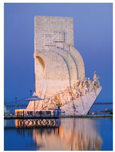
Lisbon's Monument to the Discoveries

Day 9: Carmona/Ronda Leaving Carmona this morning we travel south to tiny Ronda, one of Spain's oldest and most aristocratic towns. It's set high in the mountains with whitewashed houses clinging improbably to the edge of El Tajo Gorge – 500 feet deep and 300 feet wide. B,D