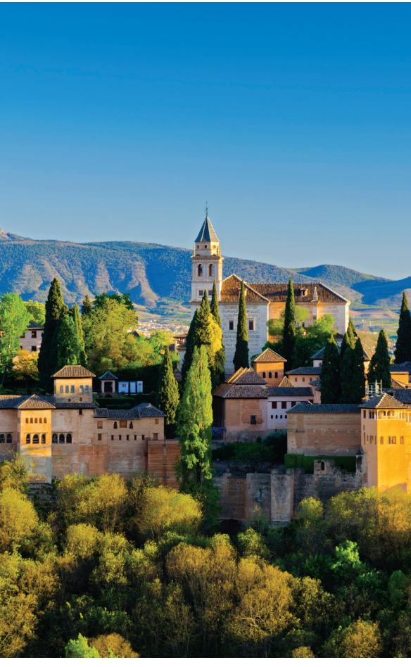
The hilltop Alhambra palace and fortress in Granada