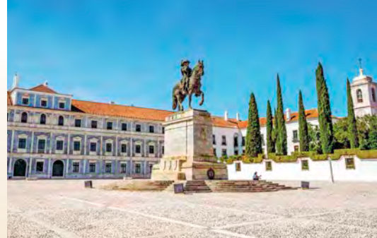
Ducal Palace, Vila Viçosa

Monsaraz. Take in the medieval atmosphere of this picturesque, hilltop village and sweeping countryside views during a guided stroll. Next, travel to Herdade do Esporão, a family-owned business on a large estate. Learn how their olive oil is made on a tour, take part in a unique