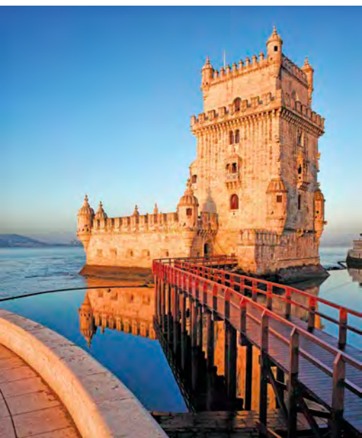
Tower of Belém, Lisbon