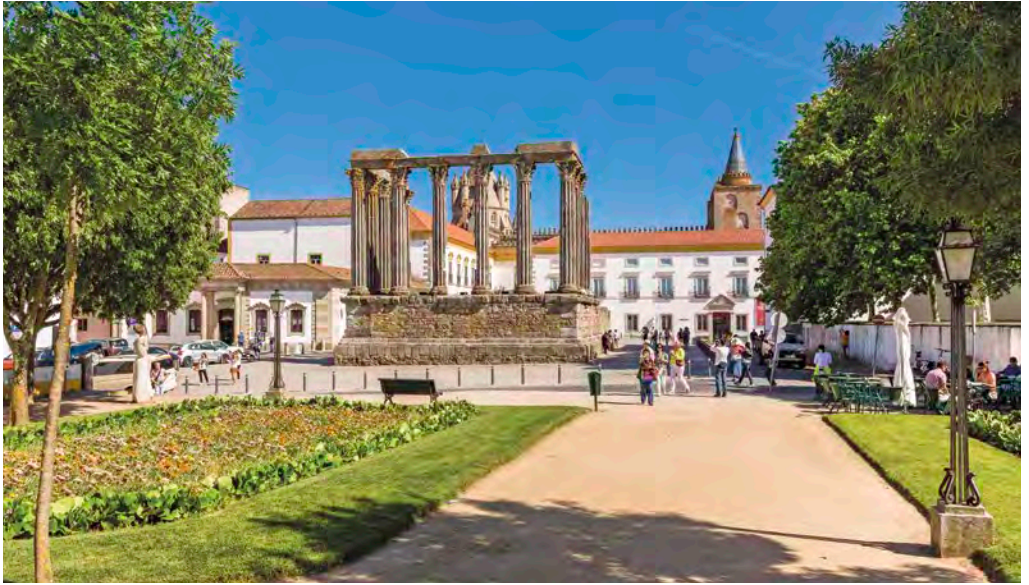
Temple of Diana, Évora