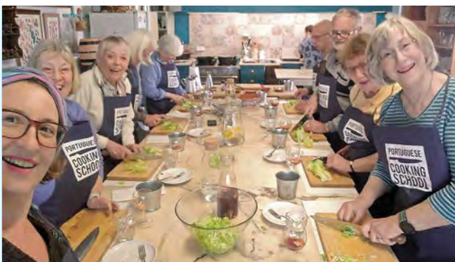
Cooking at Sofia's farmhouse near Évora