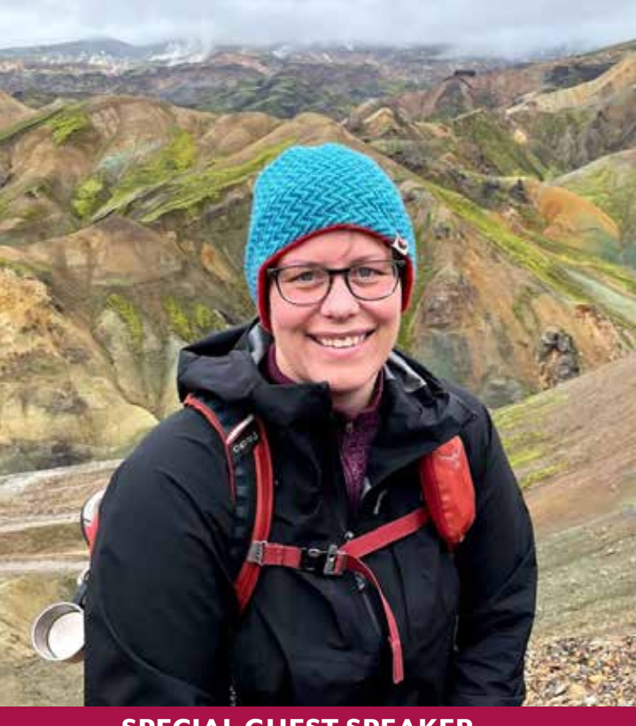
SPECIAL GUEST SPEAKER