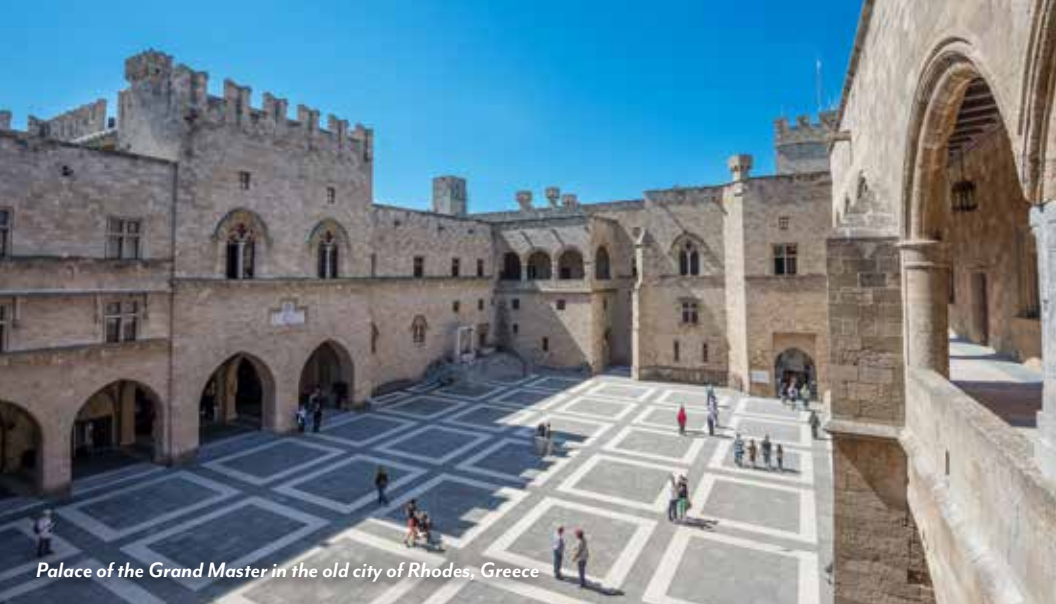
Palace of the Grand Master in the old city of Rhodes, Greece