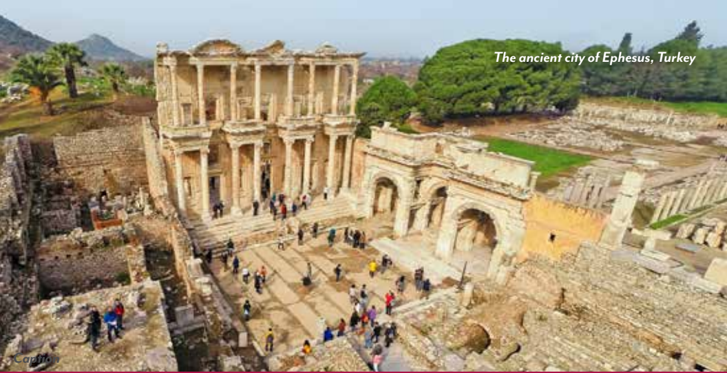
The ancient city of Ephesus, Turkey