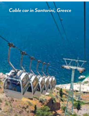
Cable car in Santorini, Greece

A traditional barbecue lunch will be served at the Nakkas Weaving Center made with ingredients from the weavers' gardens. Return to Kusadasi for a classical concert at the Ottoman-era Caravanserai building, built in 1618 as a wayside inn for travelers and merchants. (B,L,D)