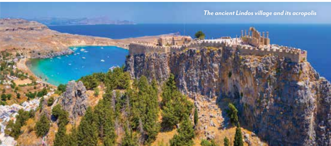
The ancient Lindos village and its acropolis

Disembark and transfer to the airport for your return flight home. (B)