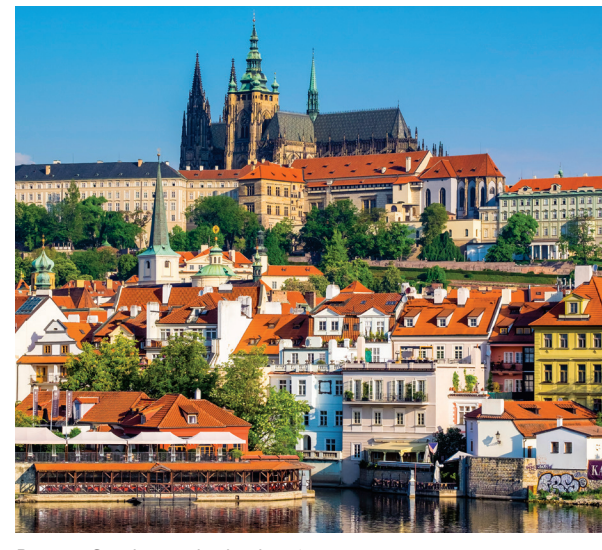
Prague Castle overlooks the city.

Jewish Cemetery with its centuries-old headstones and generations buried atop one another, as well as several of the once-thriving synagogues now part of the Jewish Museum of Prague. Then the remainder of the day is at leisure, perhaps to stroll through Old Town Square or visit Wenceslas Square, site of the demonstrations that led to the Velvet Revolution. Tonight we enjoy a farewell dinner at our hotel. B,D