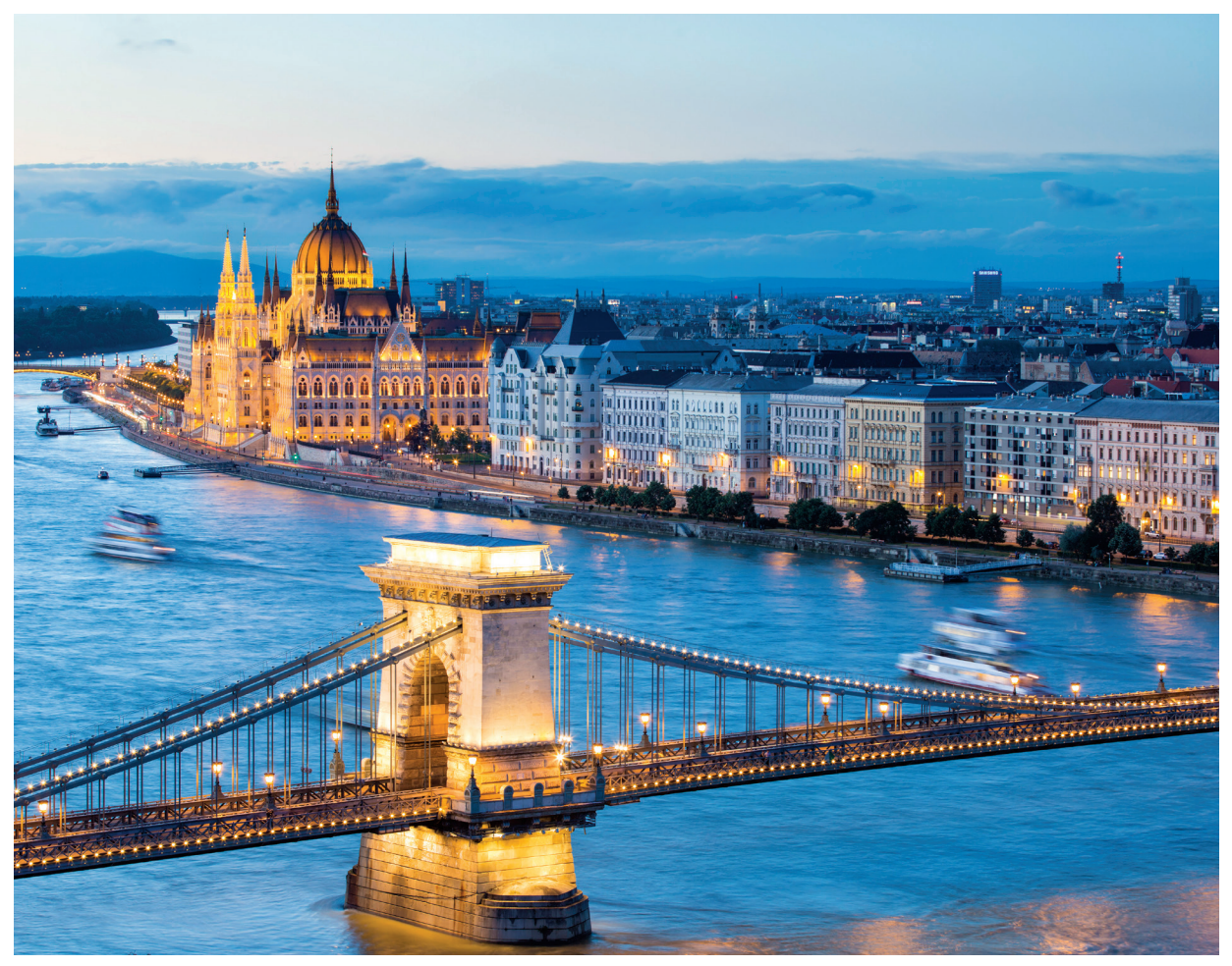
Budapest's Chain Bridge spans the Danube and connects Buda and Pest.

Ratings are based on the Hotel & Travel Index, the travel industry standard reference. Unrated hotels may be too small, too new, or too remote to be listed.