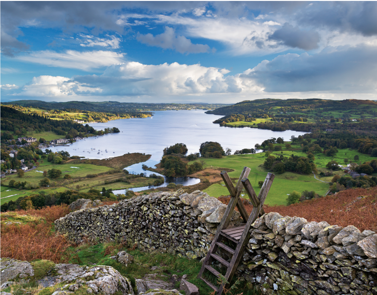
Now a UNESCO site, England's Lake District has drawn visitors since Wordsworth helped to spread the word in the early 19 th century.

Ratings are based on the Hotel & Travel Index, the travel industry standard reference.