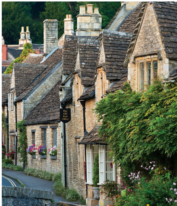
Charming Cotswolds cottages

Day 9: North Wales/Stratford-upon-Avon Returning to England today, we travel to Stratford-upon-Avon, where our touring includes a visit to Anne Hathaway’s Cottage & Gardens, the thatched farmhouse of Shakespeare’s bride that still contains some original furnishings. We also tour Shakespeare’s Birthplace, a restored 16 th -century half-timbered house where the Bard is believed to have been born in 1564. Then we have time in this 800-year-old market town for lunch on our own and to explore independently before we dine together at our hotel this evening. B,D