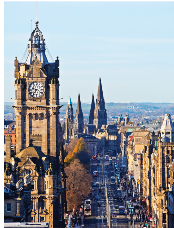
Edinburgh’s popular Princes Street

wondrous city as we wish; London offers an embarrassment of riches from which to choose. Tonight we celebrate our journey through Britain at a farewell dinner. B,D