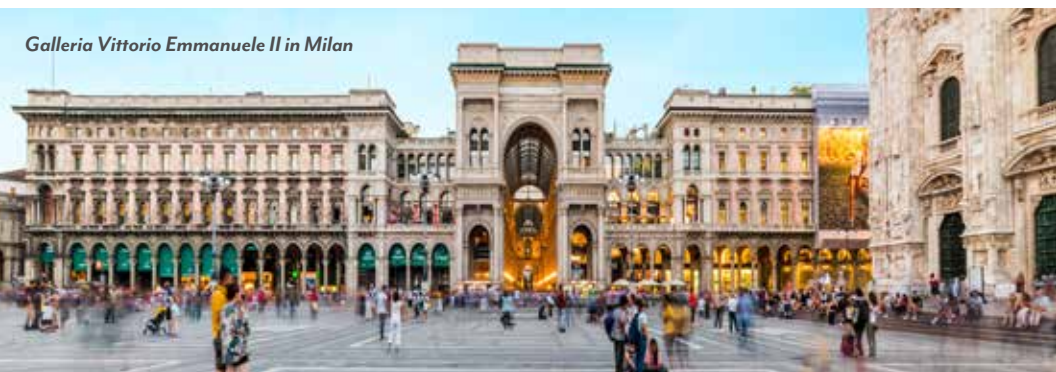
Galleria Vittorio Emmanuele II in Milan