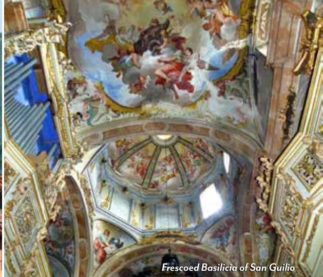
Frescoed Basilica of San Giulio

the genius of Leonardo da Vinci's famous work, "The Last Supper." Enjoy dinner on your own. (B)