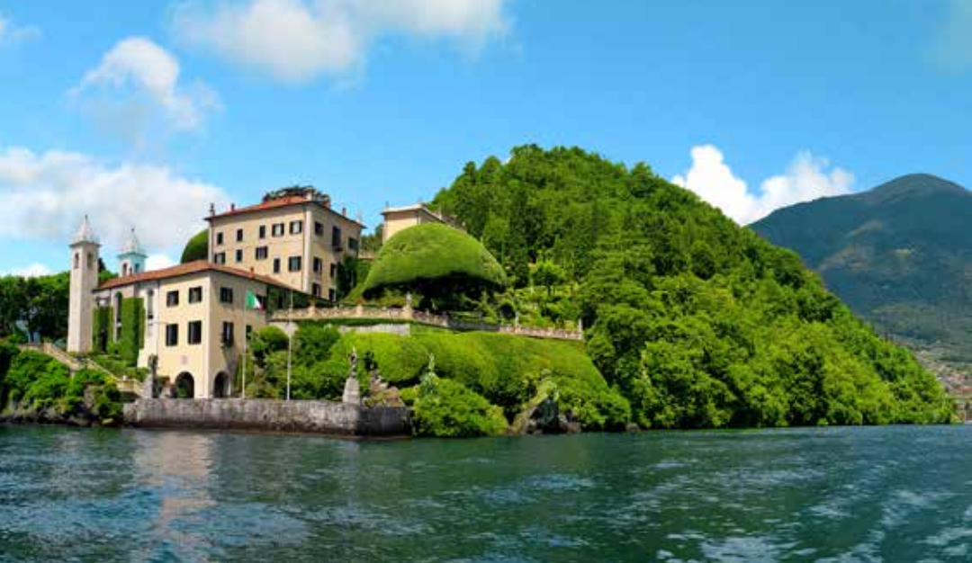
Villa del Balbianello on Lake Como

Immerse yourself in the fascinating culture and breathtaking scenery surrounding some of Italy's beautiful lakes. This nine-day, seven-night Italian land trip will have many medieval sites to explore and stunning art to admire. Start and end each day of this journey in the luxurious PALACE HOTEL in Como. Live and learn like a local villager with lectures from knowledgeable local art and history experts intimately familiar with the area and its past. Experience the sights within the fascinating medieval walls of Old Como and admire the awe-inspiring frescos inside the San Fedele Church—and later within Orta's chapels dedicated to St. Francis of Assisi and San Giulio's Basilica. Float in an exclusive boat ride on Lake Maggiore to Isola Bella, home to unique caves previously used as living spaces for villagers to escape the summer heat. Visit the stunning Palazzo Borromeo and lavish gardens on the island. Enjoy a guided tour through Milan's Duomo—the largest Gothic cathedral in the world—and gaze at the wondrous artistic and architectural relics of its storied, centuries-long history. Learn about Villa del Balbianello's humble beginnings as a small Franciscan monastery and present-day home to a rich collection of Chinese, African, and pre-Columbian art. Travel throughout the picturesque Bellagio and plunge into its colorful coastal culture. No matter where you end up on this wonderful tour, there will be no shortage of striking sights amid these Italian lakes.