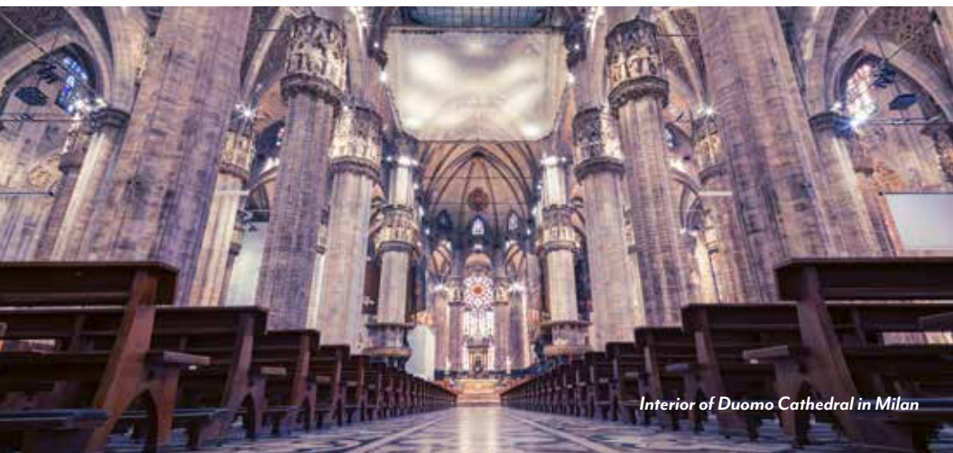
Interior of Duomo Cathedral in Milan