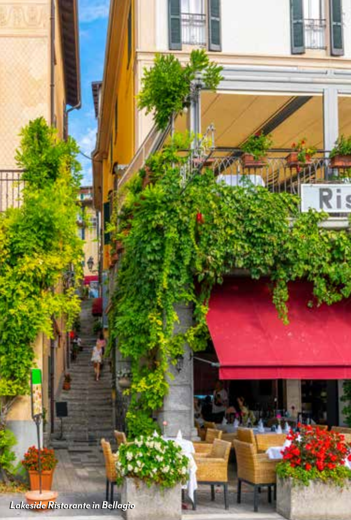
Lakeside Ristorante in Bellagio