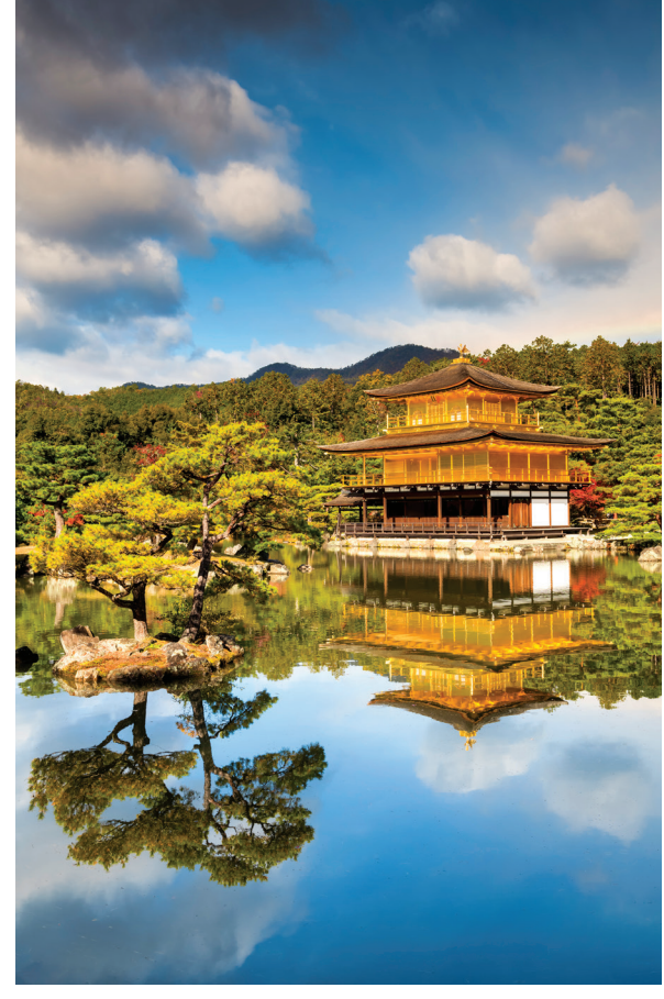
We visit Kyoto's Temple of the Golden Pavilion on Day 10.