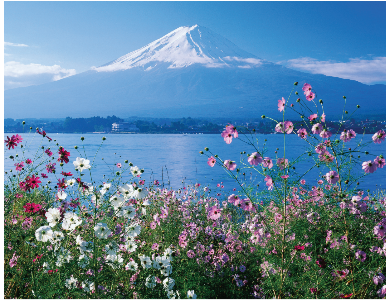
A UNESCO site and "Special Place of Scenic Beauty," beloved Mount Fuji has drawn visitors for centuries.

Ratings are based on the Hotel & Travel Index, the travel industry standard reference. Unrated hotels may be too small, too new, or too remote to be listed.