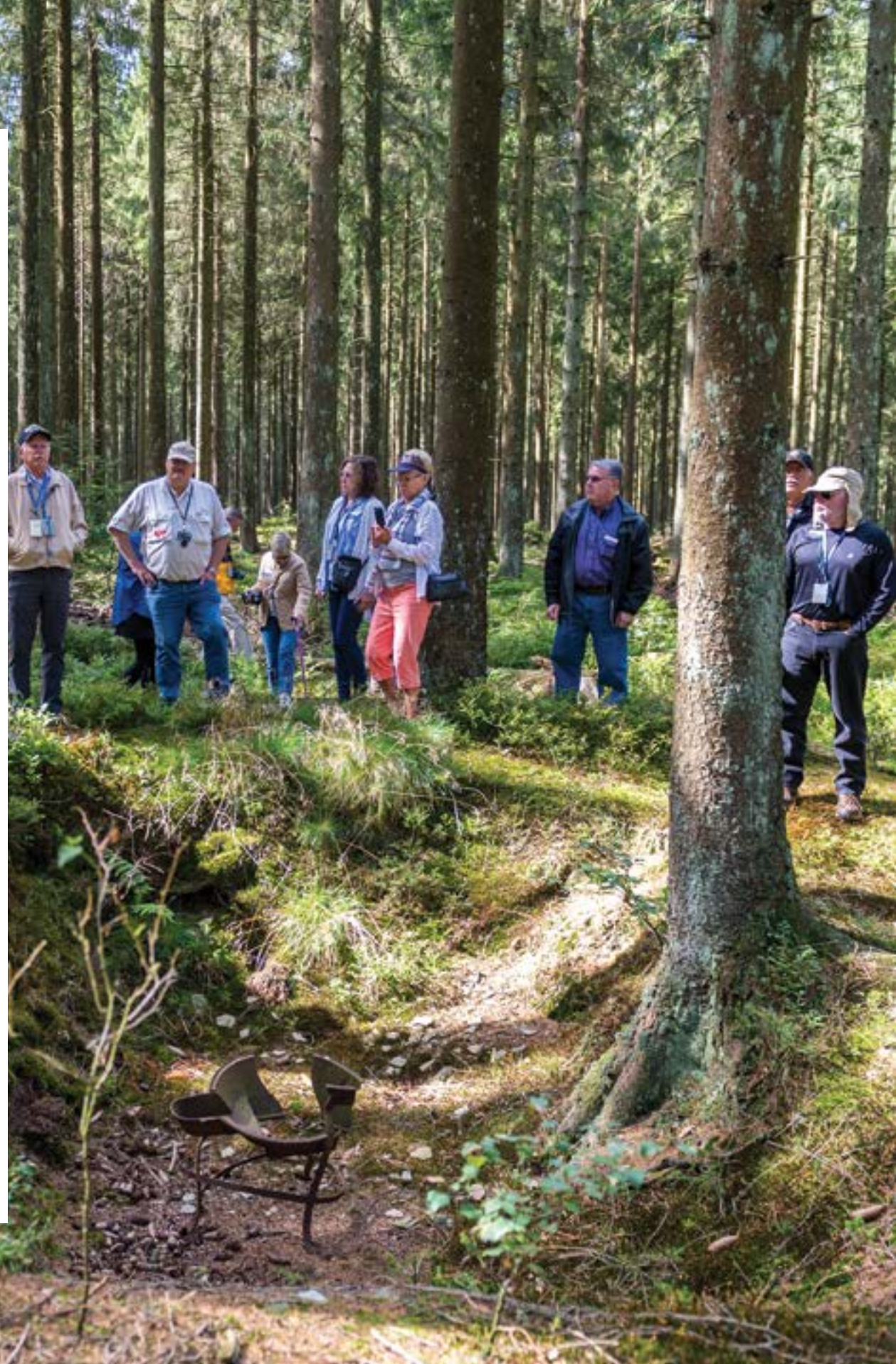
COVER PHOTO: AERIAL VIEW OF HITER'S EAGLES NEST. BACKGROUND PHOTO: TOUR GUESTS EXPLORE THE FOXHOLES DUG BY MEMBER OF EASY COMPANY DURING THE BATTLE OF THE BULGE. BOIS JACQUES FOREST, BELGIUM.