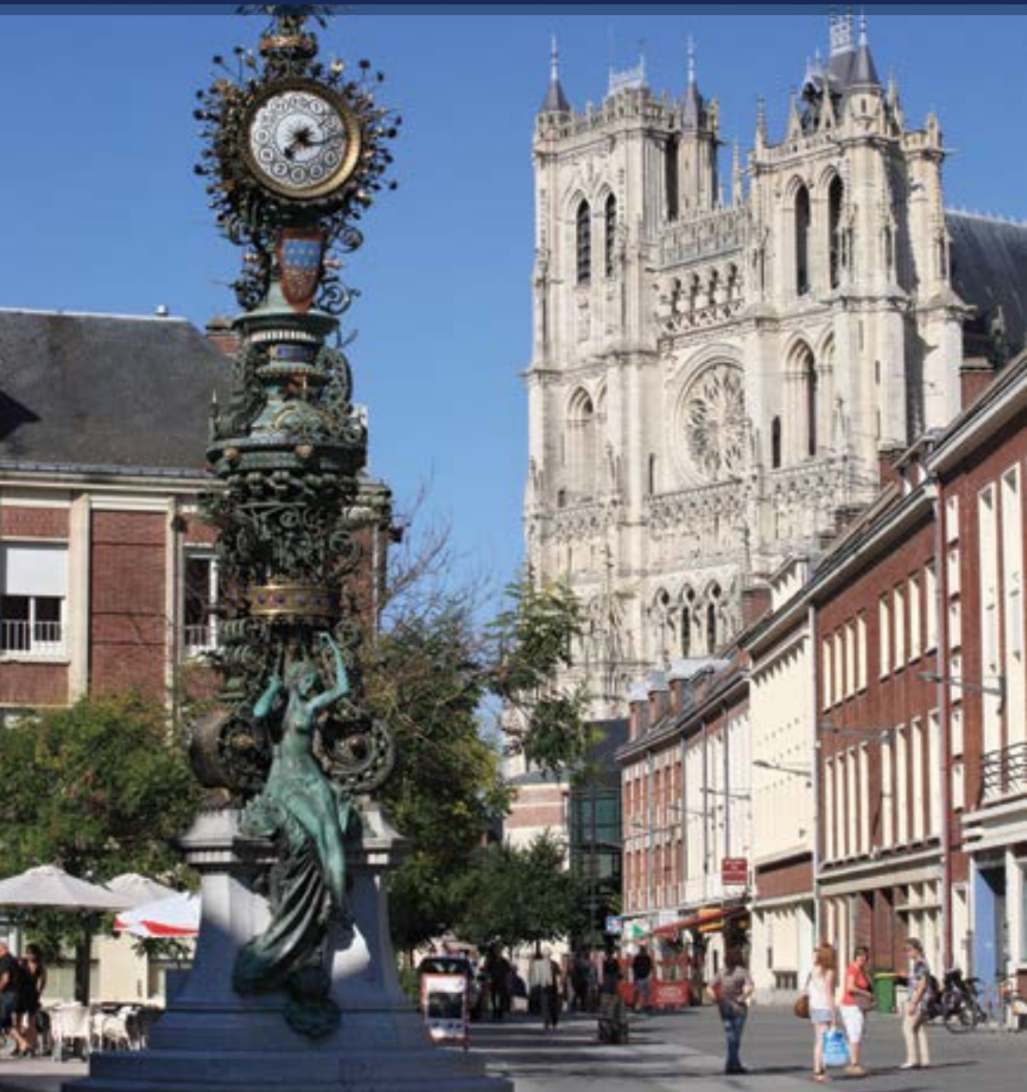
VIEW OF AMIENS DEWAILLY CLOCK AND THE CATHEDRAL OF OUR LADY OF AMIENS, AMIENS, FRANCE.