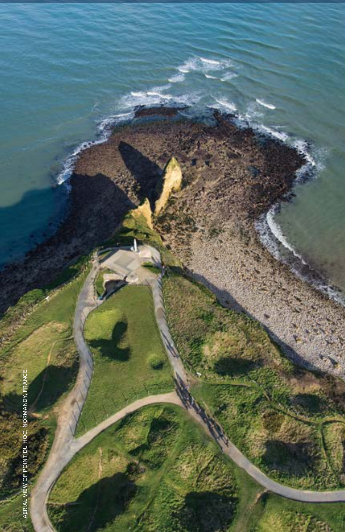
AERIAL VIEW OF POINT DU HOC, NORMANDY, FRANCE.