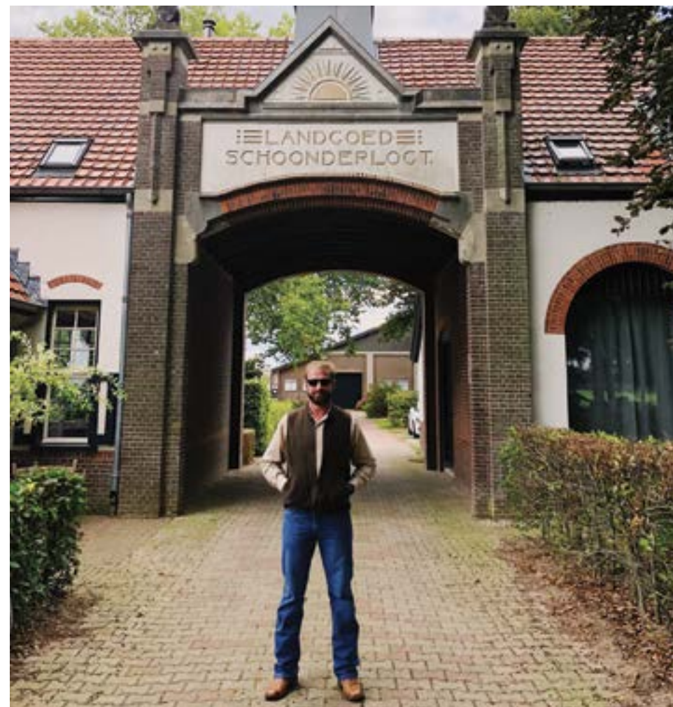
TOUR GUEST AT SCHOONDERLOGT, HOLLAND.