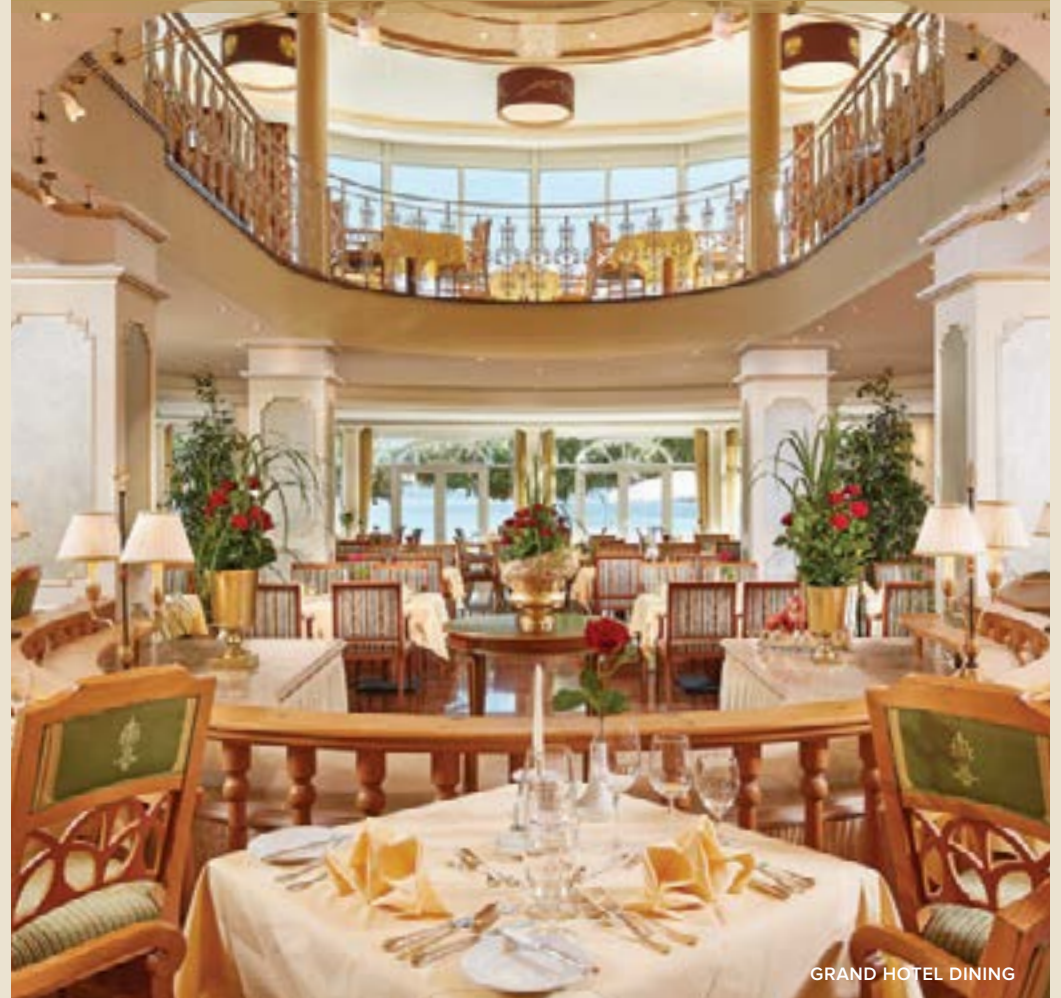
GRAND HOTEL DINING