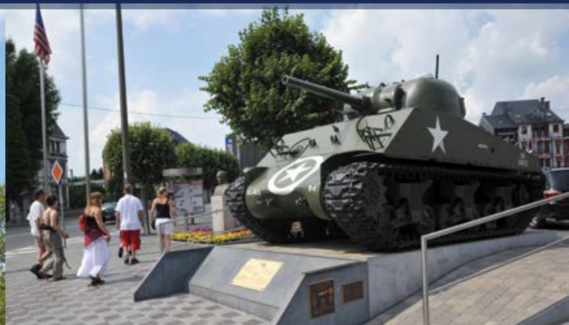
A SHERMAN TANK AND THE GENERAL MCAULIFFE MEMORIAL PICTURED ON THE MCAULIFFE SQUARE IN BASTOGNE, BELGIUM.