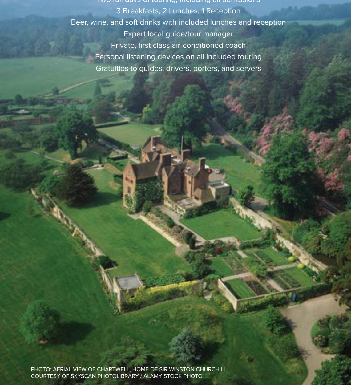
PHOTO: AERIAL VIEW OF CHARTWELL, HOME OF SIR WINSTON CHURCHILL. COURTESY OF SKYSCAN PHOTOLIBRARY / ALAMY STOCK PHOTO.