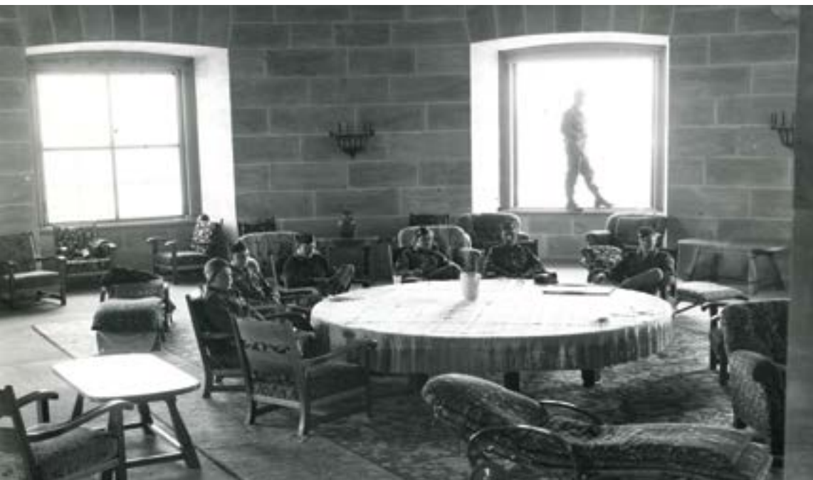
PHOTO: 101ST AIRBORNE AT HITLER’S EAGLE’S NEST.

Accommodations: Grand Hotel Zell Am See (B, D)