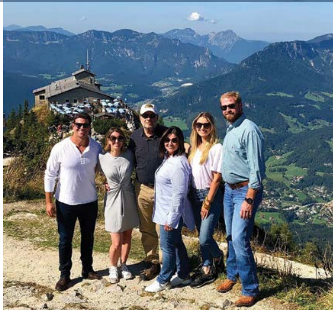
PHOTO: TOUR GUESTS AT HITLER’S EAGLE’S NEST, COURTESY OF THE NATIONAL WWII MUSEUM.