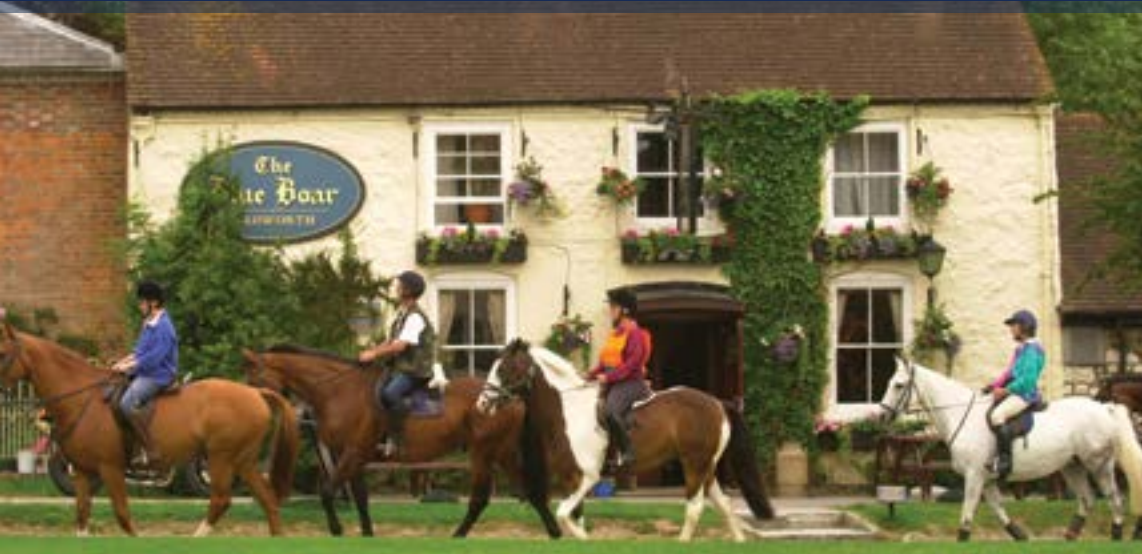
PHOTO: THE BLUE BOAR PUB IN THE VILLAGE OF ALDBOURNE , ENGLAND