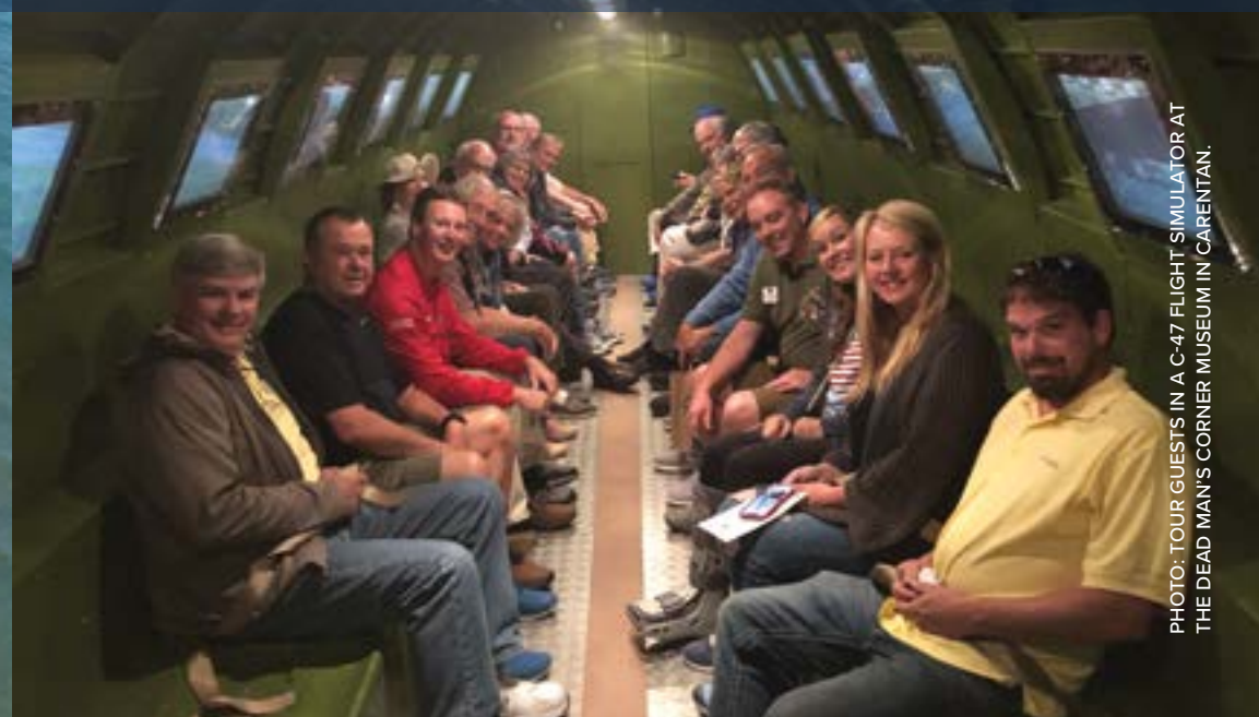
PHOTO: TOUR GUESTS IN A C-47 FLIGHT SIMULATOR AT THE DEAD MAN'S CORNER MUSEUM IN CARENTAN.