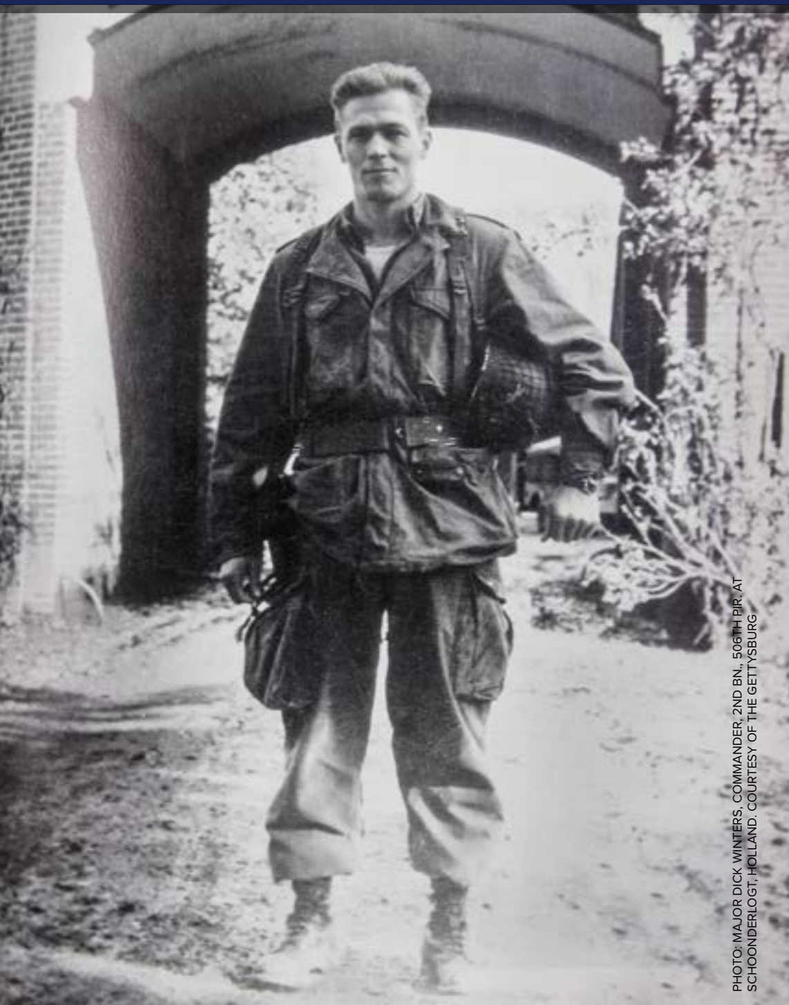
MAJOR DICK WINTERS, COMMANDER, 2ND BN., 506TH PIR, AT SCHOONDERLOGT, HOLLAND.

Distinguished Service Cross, Bronze Star with Oak Leaf Cluster and Purple Heart