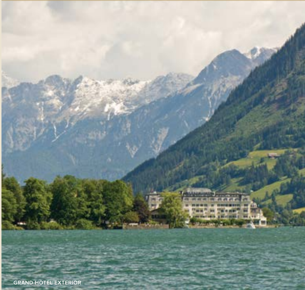
GRAND HOTEL EXTERIOR