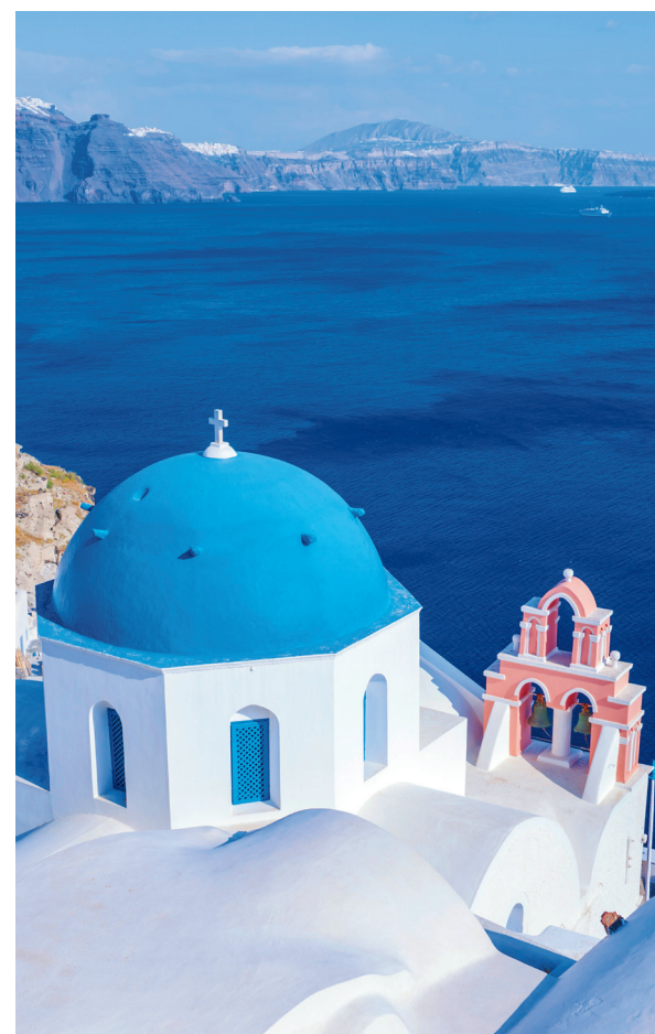
We spend two nights in idyllic Santorini.