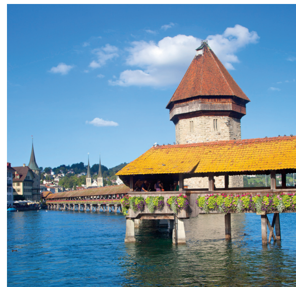
Lucerne's beloved Kapellbrücke (Chapel Bridge)

paid multiple visits before it was captured by the Allies in the closing days of WWII. In the event Eagle's Nest is closed because of unseasonal weather, we'll visit the nearby Berchtesgaden Salt Mine, which has operated continuously for more than 500 years. After lunch together, we take a walking tour of the village of Berchtesgaden, once the residence of the Bavarian royal family. Then we return to Salzburg, where the rest of the afternoon is at leisure before we celebrate our splendid journey at a farewell dinner. B,L,D