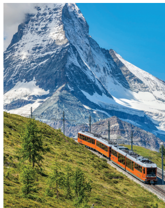
The Gornergratbahn open-air railway

Day 9: Lugano/Vaduz, Liechtenstein/Seefeld, Austria Leaving the Lake District today, we're bound for Austria by way of the tiny sovereign nation of Liechtenstein. We reach the country's scenic capital of Vaduz mid-morning then have some free time to explore and have lunch on our own. This afternoon we visit a royal attraction: the Cellars of the Prince of Liechtenstein, the prince's own winery set on 10 grape-growing acres just outside Vaduz. We stroll through the vineyard, tour the wine cellars, and sample the wines on offer here. From here we travel on to