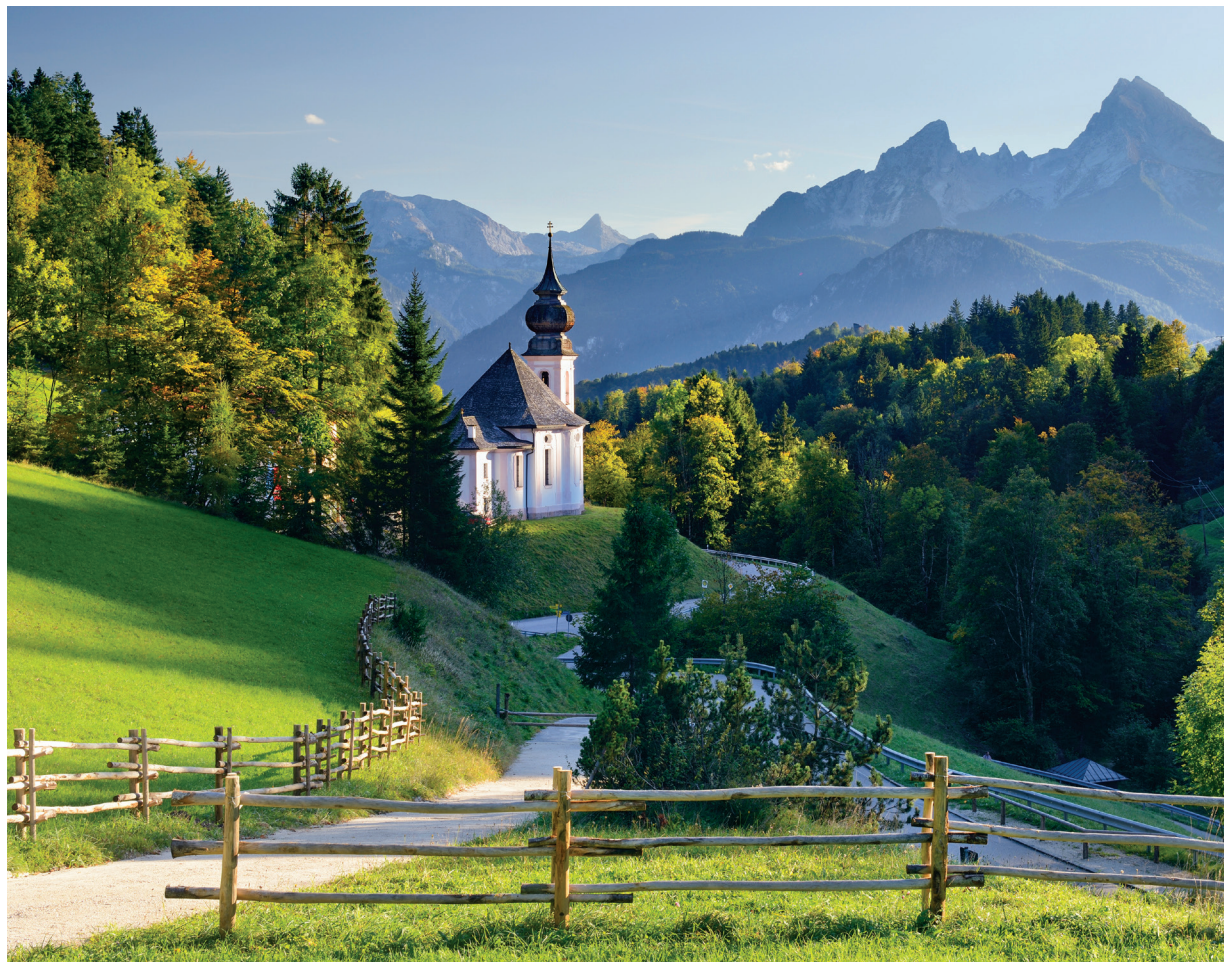
Majestic Alpine scenery surrounds us throughout our tour.