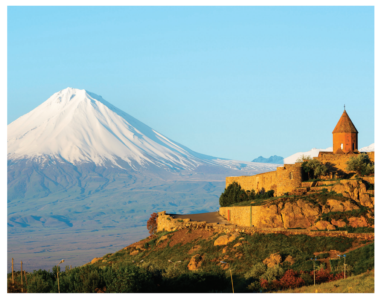
From the Khor Virap monastery, which we visit on Day 5, we can see biblical Mt. Ararat in Eastern Turkey.

Ratings are based on the Hotel & Travel Index, the travel industry standard reference.