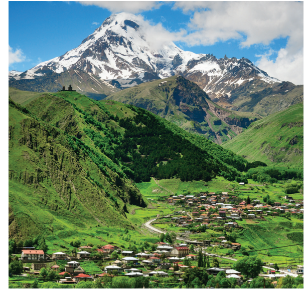
Stepantsminda, at the foot of Mt. Kazbek bordering Russia