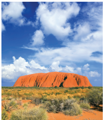
Aboriginal site of Uluru (Ayers Rock)

Day 14: Mount Cook This morning’s tour of alpine Mount Cook Village includes a visit to the Sir Edmund Hillary Alpine Center, where we see a 3D planetarium movie about the region. We also visit the Hillary Gallery, commemorating Sir Edmund’s