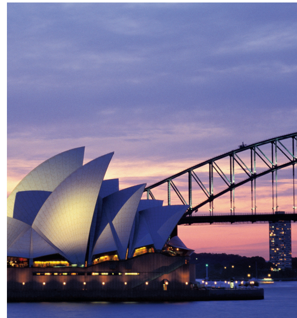
The Sydney Opera House and Harbour Bridge at dusk

Day 21: Auckland Our half-day tour of this city set atop 48 volcanic hills features glittering Auckland Harbour and the America’s Cup Village. We also visit the War Memorial Museum, with its prized Maori and Pacific Islander collections. Tonight we enjoy a farewell dinner at our hotel. B,D