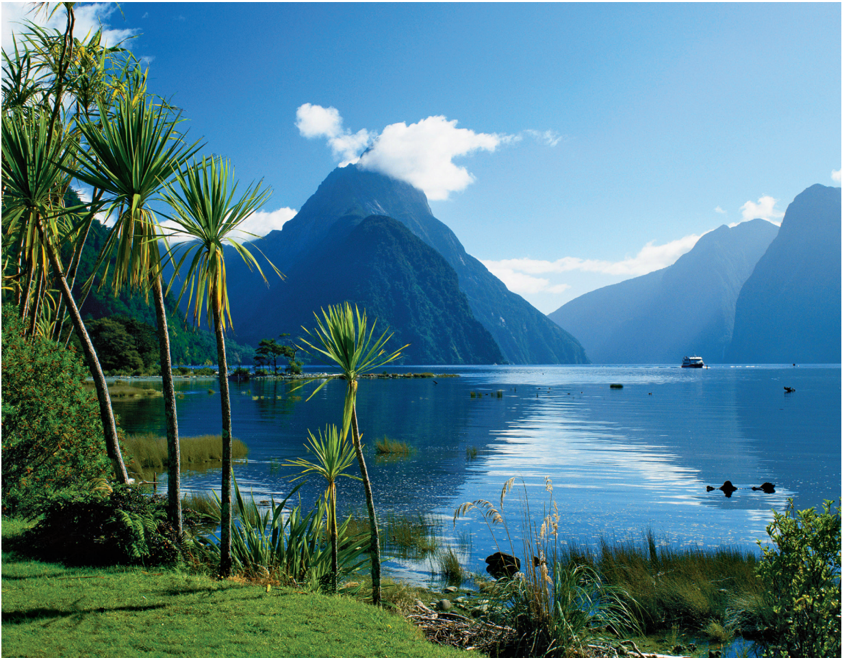
On Day 16, we see for ourselves why serene Milford Sound ranks as New Zealand’s most popular destination.

Ratings are based on the Hotel & Travel Index, the travel industry standard reference.