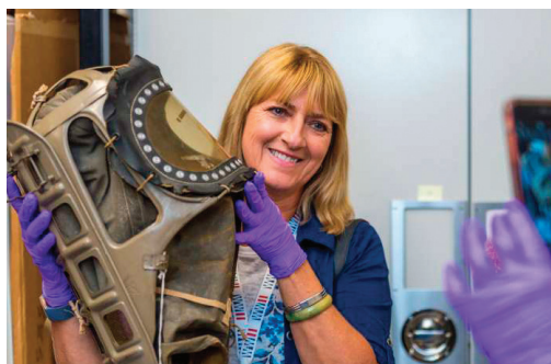
OUT OF THE VAULT MUSEUM TOUR WITH A MUSEUM CURATOR