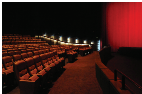
BEYOND ALL BOUNDARIES A UNIQUE CINEMA EXPERIENCE