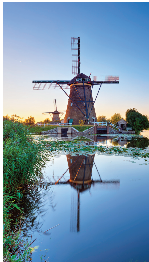
We visit the windmills at Kinderdijk on Day 5.