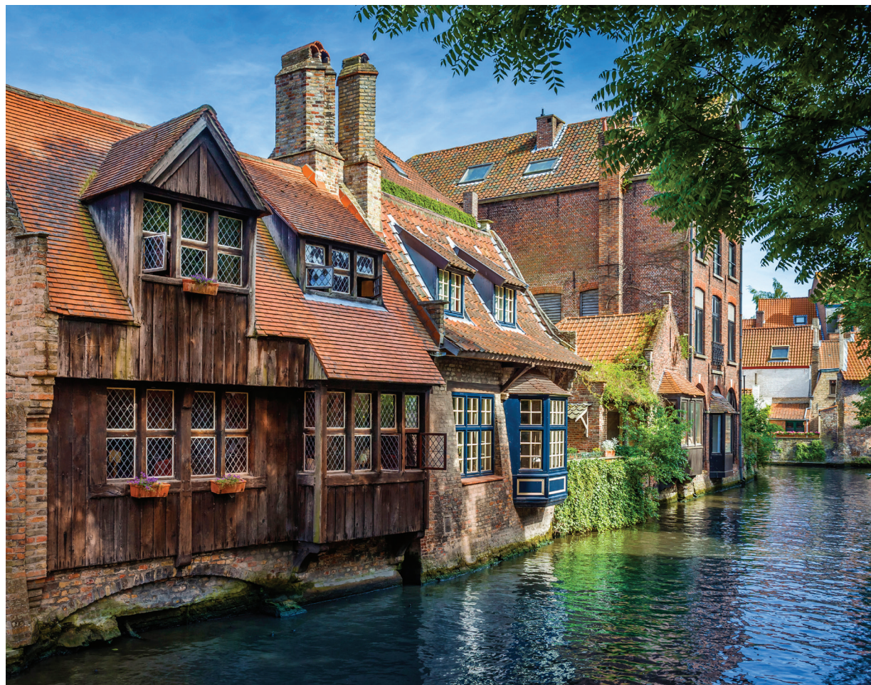
With its canals, cobbled streets, and medieval buildings, today's Bruges evokes its storied past.

Europe of old – and new – springs to life on this relaxed journey through cities rich with art and architecture, vibrant street life, storied surroundings, and prized UNESCO sites. We travel from canal-laced Amsterdam and medieval Bruges to diverse Luxembourg and romantic Paris ... in our own moveable feast of culture, cuisine, and comfort.