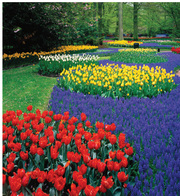
Tulips in bloom at Keukenhof

Day 12: Depart Paris for U.S. We transfer to the airport this morning for our return flight to the United States. B