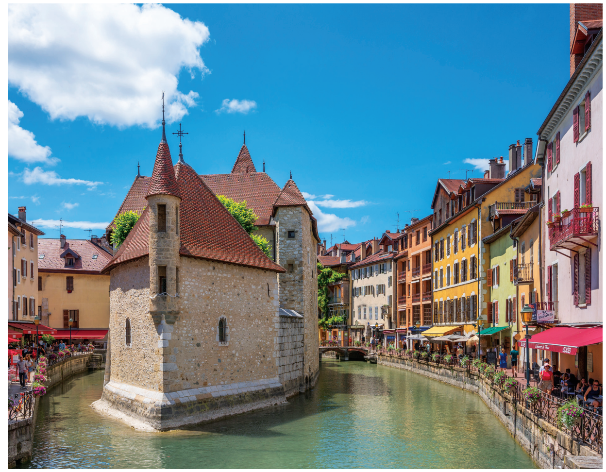
We visit canal-laced Annecy, the "Venice of the Alps," on Day 9.

Ratings are based on the Hotel & Travel Index, the travel industry standard reference.