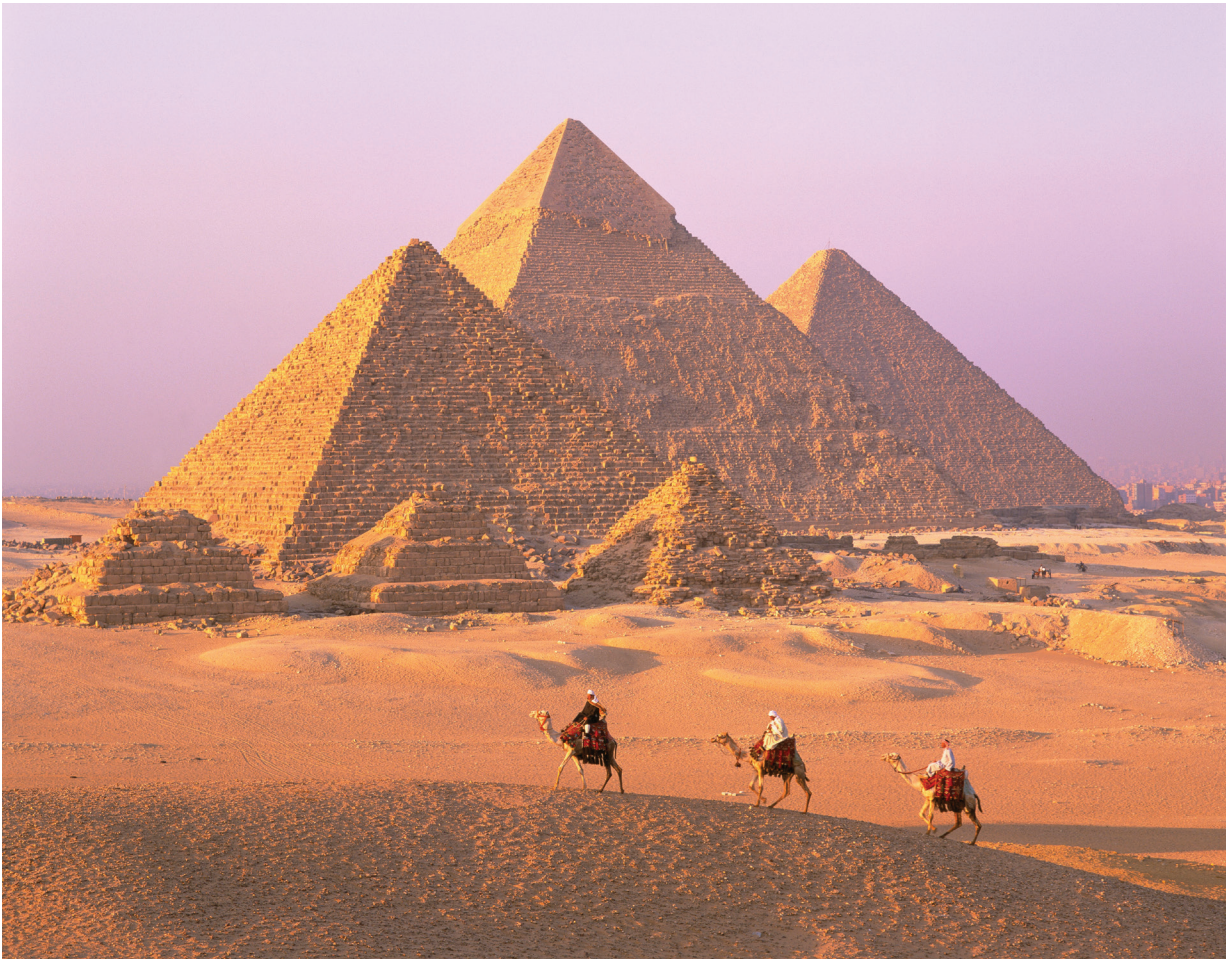
On Day 4 we travel to the Giza plateau to see the legendary pyramids, built 5,000 years ago as royal tombs.

Ratings are based on the Hotel & Travel Index, the travel industry standard reference.