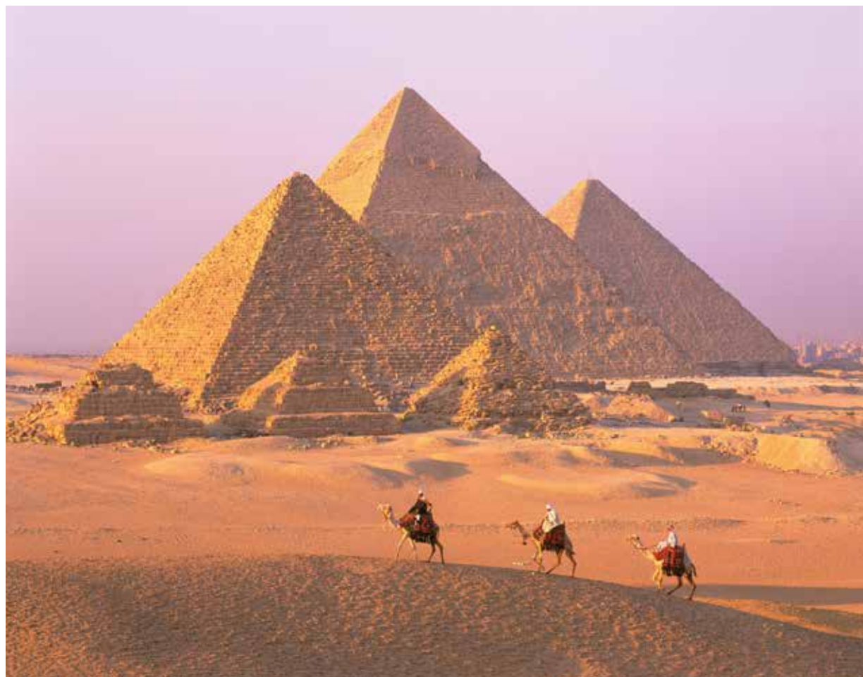
On Day 4 we travel to the Giza plateau to see the legendary pyramids, built 5,000 years ago as royal tombs.