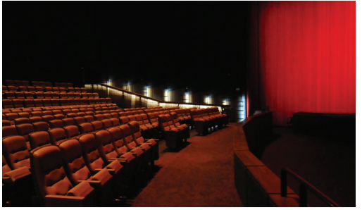
BEYOND ALL BOUNDARIES A UNIQUE CINEMA EXPERIENCE