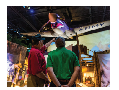
The Road to Tokyo Gallery, Campaigns of Courage