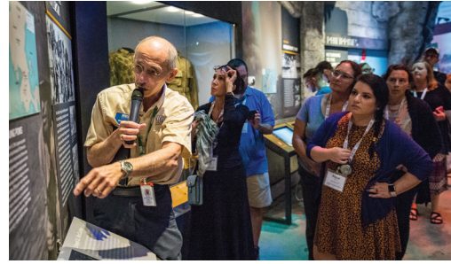
EARLY ACCESS TO CAMPAIGNS OF COURAGE GALLERIES