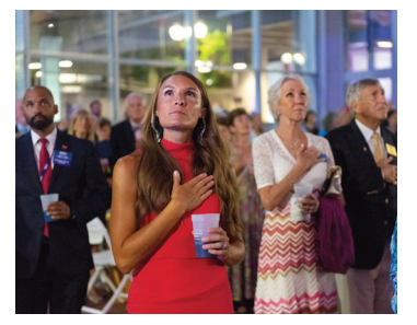
Expressions of American Experience