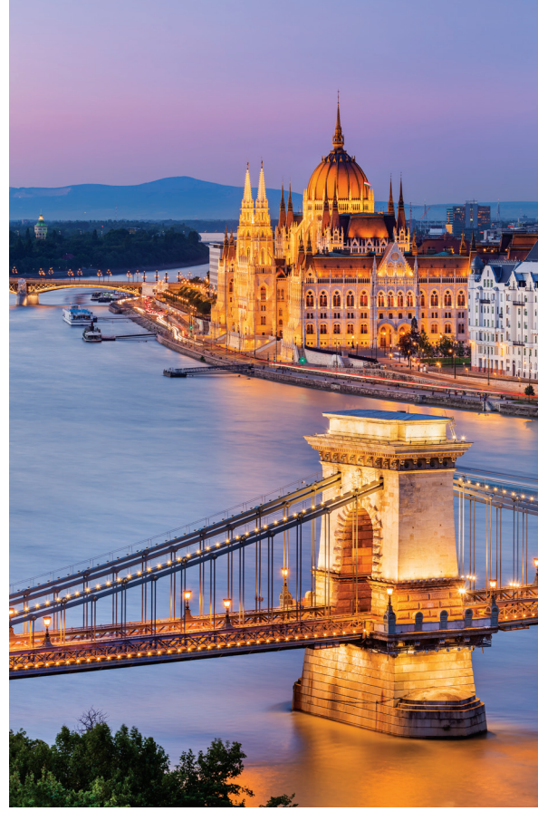
Budapest's Chain Bridge and neo-Gothic Parliament building