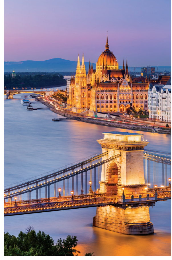
Budapest's Chain Bridge and neo-Gothic Parliament building