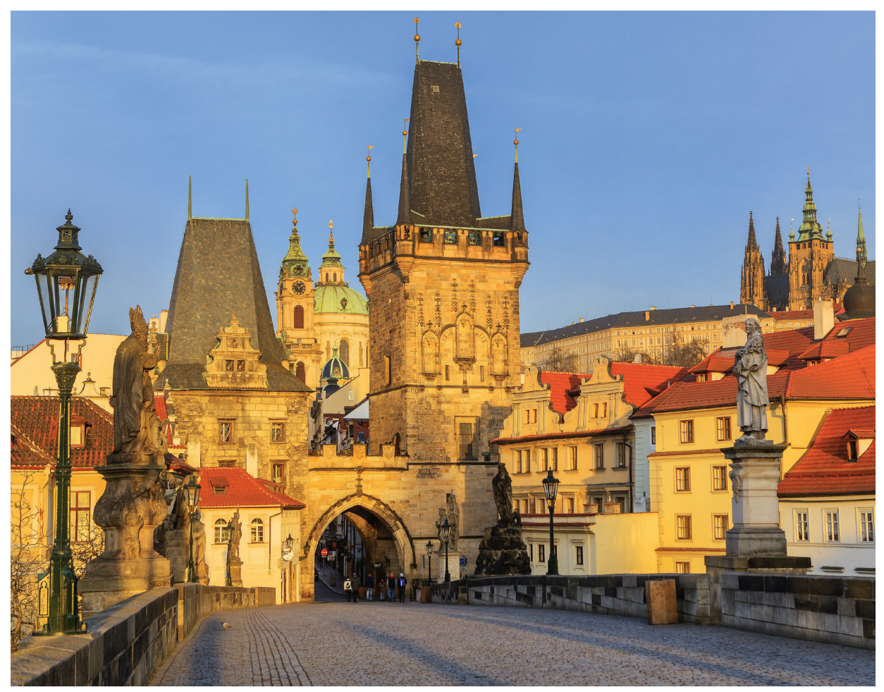
The medieval Charles Bridge over the Vltava River dates to 14th-century Prague.

Ratings are based on the Hotel & Travel Index, the travel industry standard reference. Unrated hotels may be too small, too new, or too remote to be listed.