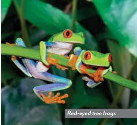
Red-eyed tree frogs