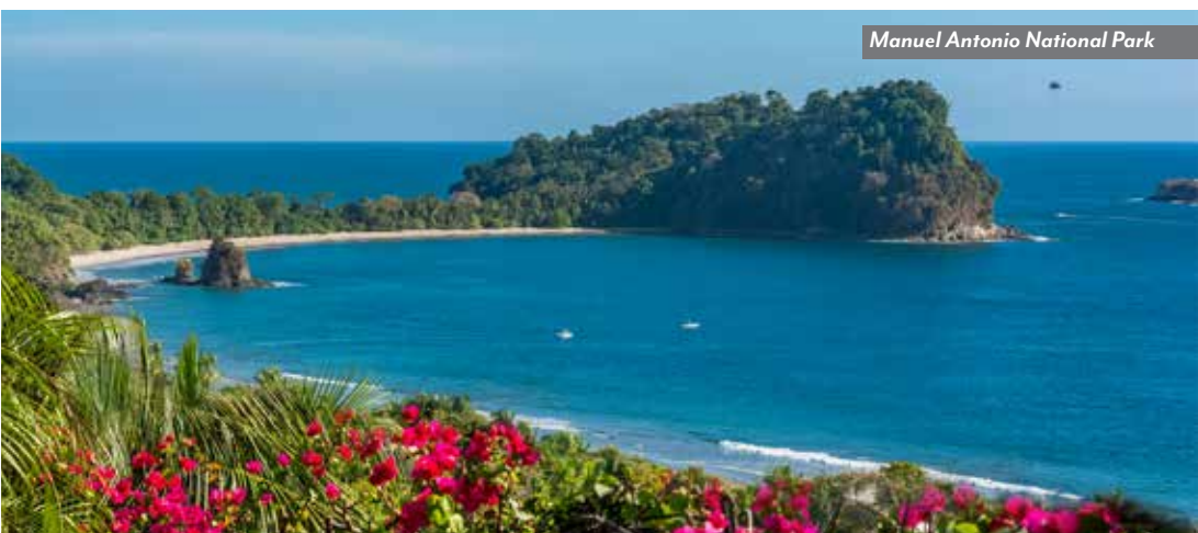
Manuel Antonio National Park

Transfer to Panama City for your return flight home.