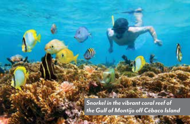
Snorkel in the vibrant coral reef of the Gulf of Montijo off Cébaco Island