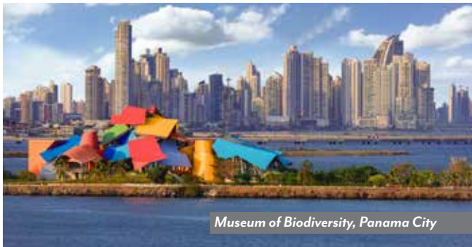
Museum of Biodiversity, Panama City

In the sparkling Gulf of Montijo, snorkel in the emerald waters of seldom-visited Cébaco Island, where schools of brilliantly colored fish, giant manta rays and four different species of turtles swim amid spectacular rock reefs.