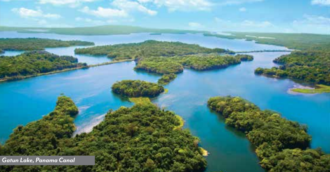
Gatun Lake, Panama Canal