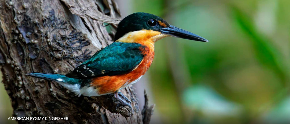
AMERICAN PYGMY KINGFISHER

WHY COSTA RICA BIRDING? Birding in Costa Rica is an extraordinary experience; with more than 900 species recorded, the country offers great birding opportunities within relatively short distances, with diverse habitats across protected areas. Costa Rica's commitment to sustainability provides habitat for native and migrant birds alike.