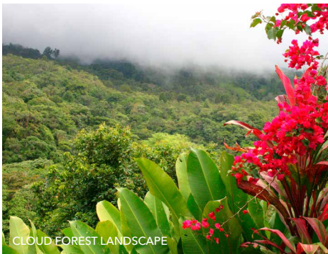
CLOUD FOREST LANDSCAPE

Spend the morning exploring the upper trails at Savegre Reserve in search of Resplendent Quetzal and some of the other species present here. (Note: The beginning of the trail is about a one-mile uphill climb.) The large centennial oaks of the forest are laden with lichens and mosses that contrast with the colorful bromeliads, adding to the