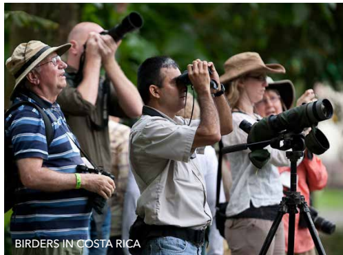
BIRDERS IN COSTA RICA