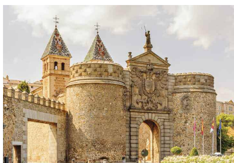
Puerta de Bisagra