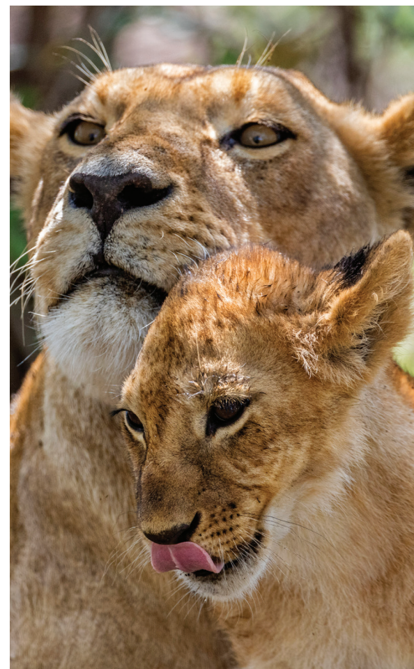
The Serengeti boasts Africa’s largest lion population.