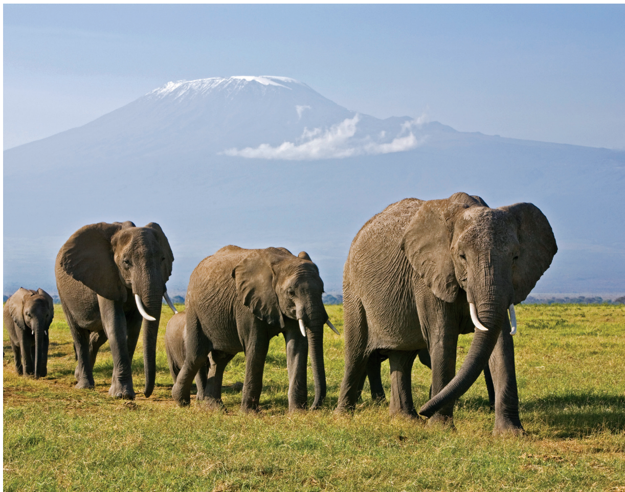
We go on safari in Kenya's Amboseli National Park, in the shadow of Mt. Kilimanjaro.

Ratings are based on the Hotel & Travel Index, the travel industry standard reference.