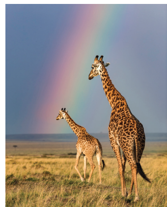
Overlooking the plains ...

Day 10: Serengeti Twice a year, some two million wildebeest, 200,000 zebra, and 300,000 Thomson’s gazelle migrate to new grazing lands between Masai Mara and the Serengeti, sparking one of nature’s most spectacular sights. But the Serengeti’s vast