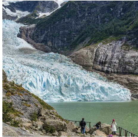
Serrano Glacier, Bernardo O'Higgins National Park

Biosphere Reserve Torres del Paine National Park