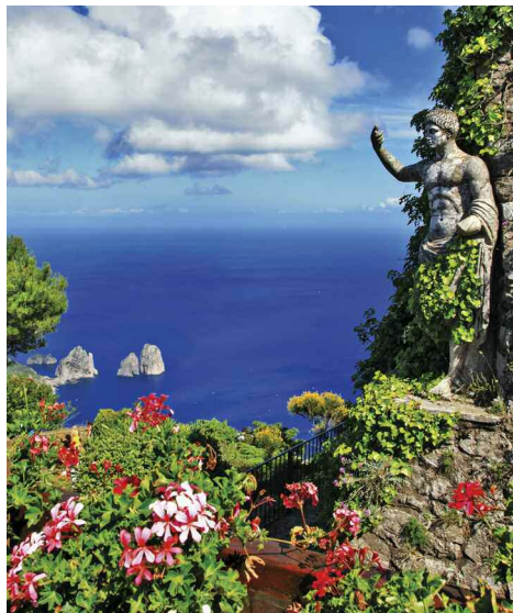
Isle of Capri