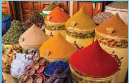
Breathe in the fragrant aromas of Moroccan spices, sold at marketplaces and presented in a signature style.

Built at the interchange of the Sahara Desert and the Atlas and Anti-Atlas Mountains, Marrakech blossomed into