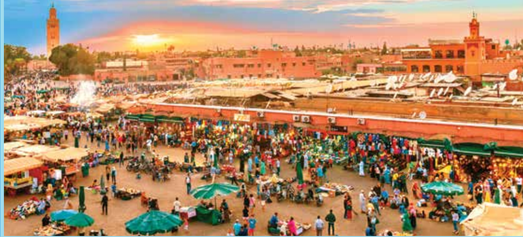
Marrakech's famous Jemaa El Fna Square is a bustling marketplace filled with a variety of vendors, ironmongers and barbers by day and storytellers, snake charmers and other entertainers by night.

the hub of the great Berber Empire. Visit masterpieces of Moorish architecture, including the exquisite Bahia Palace, glorious Menara Gardens and 12 th -century Koutoubia Mosque.