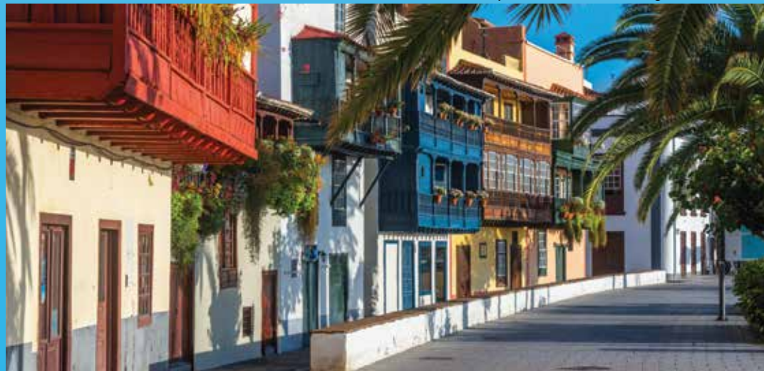
The 15 th -century city of Santa Cruz de La Palma was the historical epicenter of trade between Spain and the American colonies. Stroll down its cobblestone streets and admire colonial-style houses with charming balconies.

Visit the Medersa Bou Inania, walk past the spectacular fountain at Nejjarine Place and see the Kairouyine Mosque. Discover the history of Seffarine Place and see its 16 th -century marble fountain, decorated with fleur-de-lys. Glimpse the famed tanneries of Fez—clusters of stone vats filled with red, yellow and brown dyes, and skins hanging to dry in the sun.