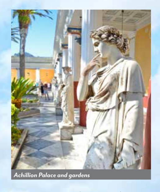
PHOTO CREDITS: Alamy, Age Fotostock, Dreamstime, ©Ponant, Shutterstock, ©Spirosparas CC BY-SA 4.0; all images are rights managed and cannot be used without permission.