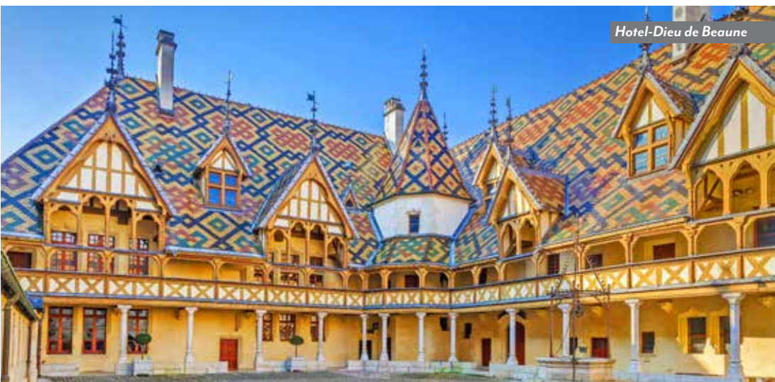
Hotel-Dieu de Beaune