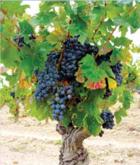
Grapes in a Provence vineyard