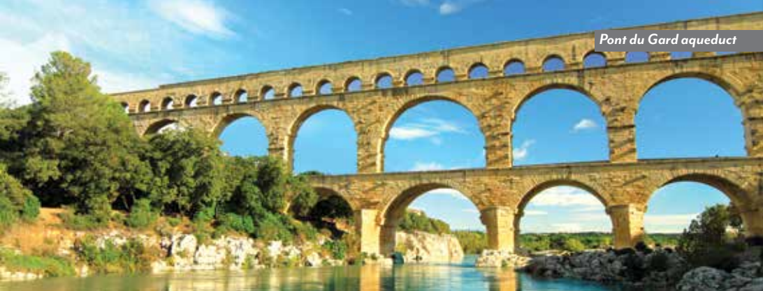
Pont du Gard aqueduct

century in testimony to Augustus Caesar. Conclude your tour with a visit to the UNESCO World Heritage-designated Pont du Gard, a 2,000-year-old Roman aqueduct that triumphs as one of Europe's most impressive archaeological sites.