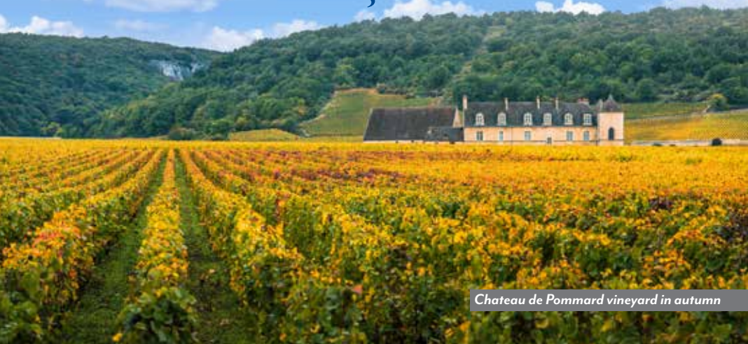
Chateau de Pommard vineyard in autumn

Provence's meticulously pruned vineyards and idyllic hillsides during the autumn harvest season form a mesmerizing backdrop for a living canvas, where a quaint streetside café in Arles once served as Van Gogh's muse, a 16 th -century castle has evolved into a renowned Beaujolais wine estate, and France's oldest Roman theater still stages performances in Lyon's Fourvière district. Experience southeast France's breathtaking landscapes, which remain forever entwined with the nation's achievements in fine art, cuisine, architecture, and literature.