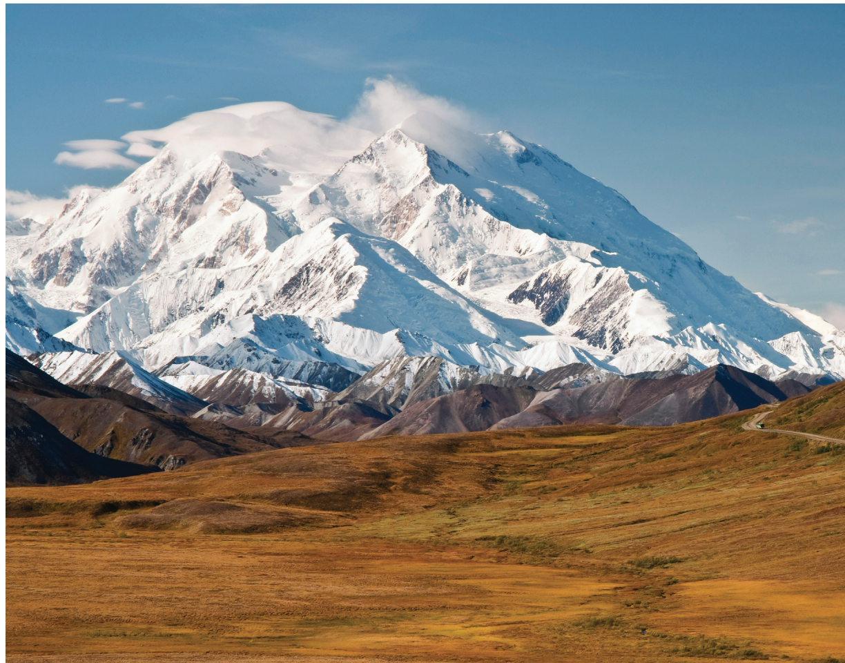
A highlight of any journey to Alaska: Denali, North America's highest peak

Awe-inspiring natural beauty and outdoor adventure await as we explore Alaska's varied landscapes and noteworthy cities. From Denali, Wrangell-St. Elias, and Kenai Fjords national parks to the energy of Anchorage and scenic Seward, our small group encounters the breadth and beauty of America's Last Frontier.