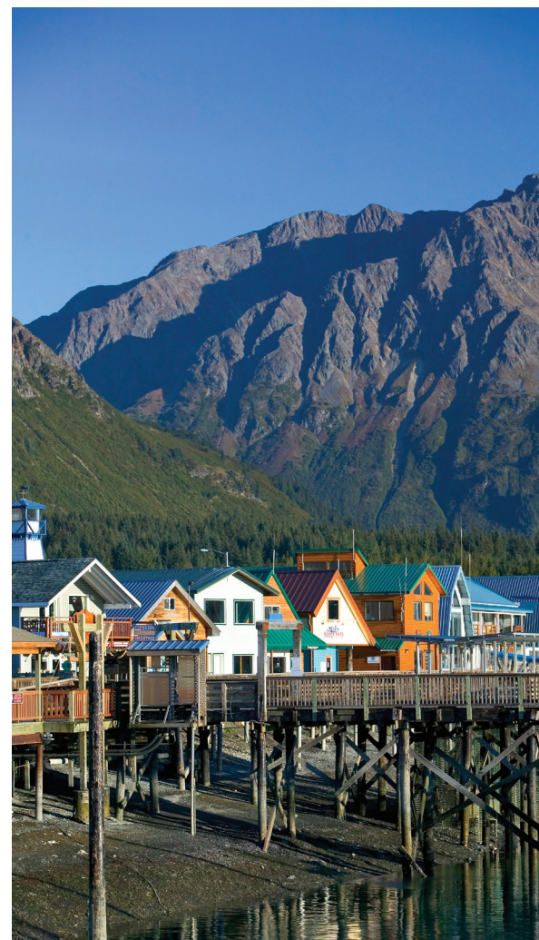
Colorful buildings overlook Seward's harbor.

Day 11: Depart Anchorage We transfer this morning to the Anchorage airport for our flights home. B